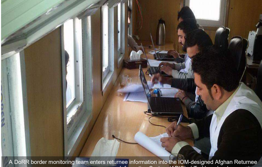
Information System (ARIS) at Torkham border crossing.

WEEKLY SITUATION REPORT 20-26 NOVEMBER 2016