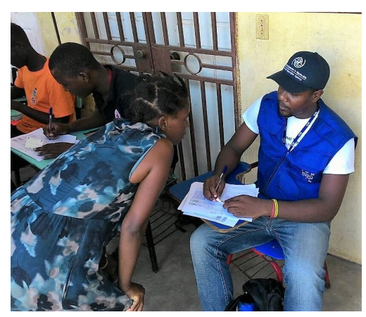
Registration in Emergency Evacuation Center EFACEP in Ouanaminthe– 9 Sep 2017

A final distribution is scheduled to take place in the last opened Emergency Evacuation Center in the North East Department on Monday 11 September in Malfety, Fort Liberté. A total of for 105 households will be assisted with NFIs;