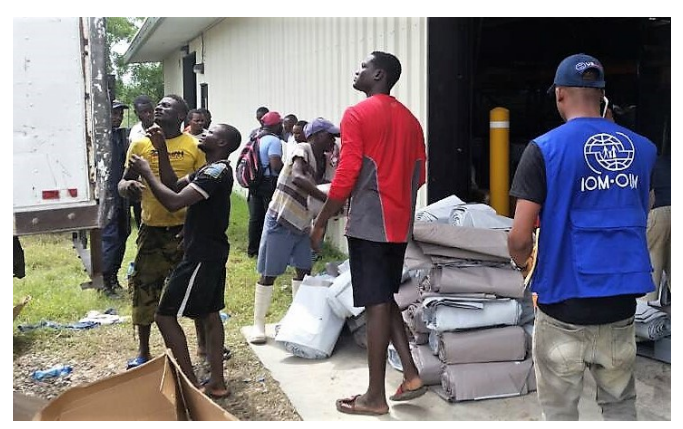
The pre-positioned NFIs arriving at the COUD of Fort Liberté— 8 Sep 2017