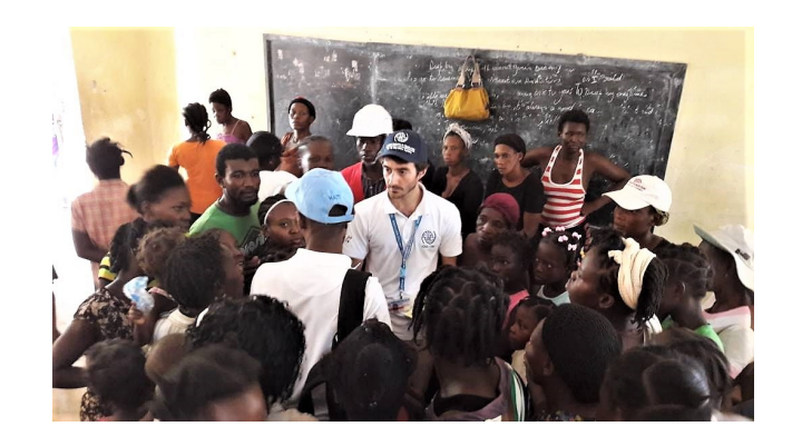
Assessments in the evacuation center EFACAP in Ouanaminthe-(North East Department)- 8 Sep 2017.