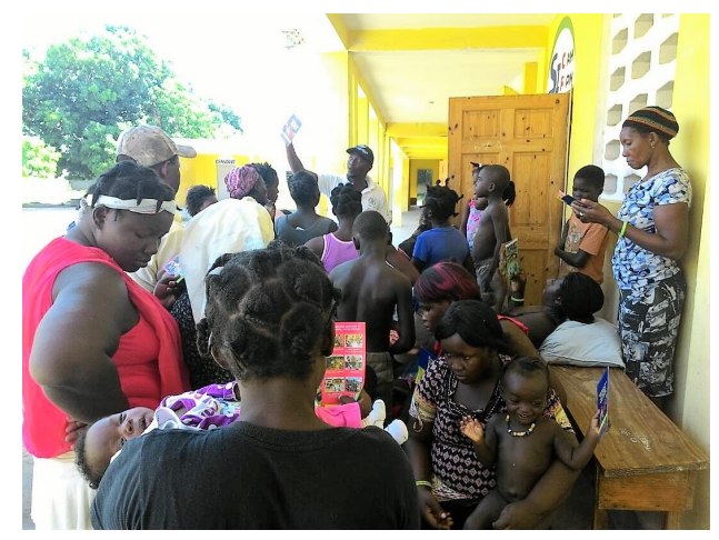
Protection sensitization activities in Ouanaminthe– 10 Sep 2017

On Sunday 10 September, IOM in collaboration with the COUD, DPC, WFP, the Déléguée Départementale and the Mayor of Ouanaminthe conducted two (2) NFI distributions for 292 families (1,550 individuals). The NFIs were provided by OFDA. Following the distributions the Emergency Evacuations Centers were closed;