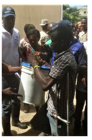
NFI distribution in Ouanaminthe- 10 Sep 2017

On Sunday 10 September, IOM in collaboration with the COUD, DPC, WFP, the Déléguée Départementale and the Mayor of Ouanaminthe conducted two (2) NFI distributions for 292 families (1,550 individuals). The NFIs were provided by OFDA. Following the distributions the Emergency Evacuations Centers were closed;