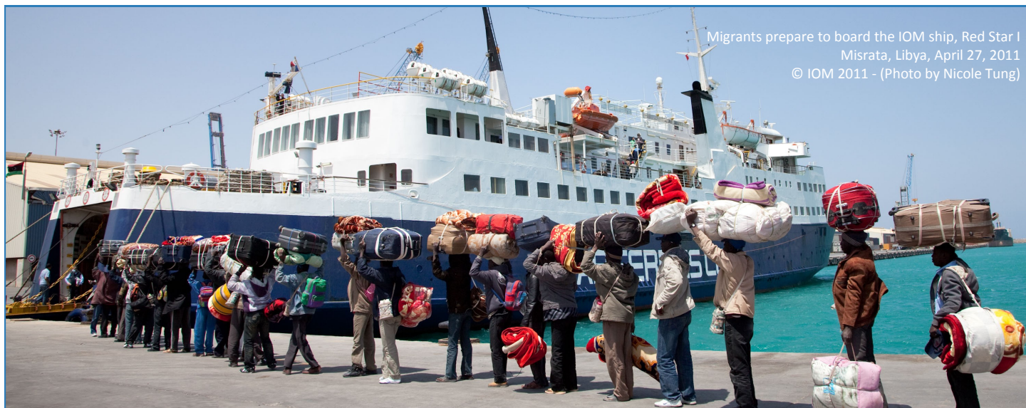
Migrants prepare to board the IOM ship, Red Star I Misrata, Libya, April 27, 2011

These events placed increased the pressure on, and importance of, all of IOM's activities in the region.