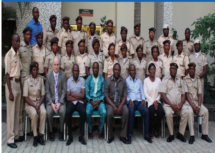
NIS officers from the south eastern zone on the last day of training