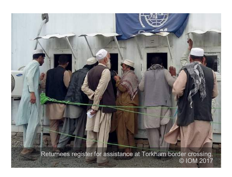
Annex 1: Cash Grants for Transportation at Kandahar Transit Center, 19-25 March 2017