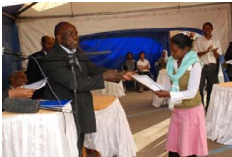
HoM awards a certificate of participation for one of the students