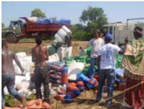
IDPs receive NFIs

"I am delightedly grateful for IOM. My daughters and I feel warm and safe at night now because we have enough blankets, plastic sheets and mosquito nets."