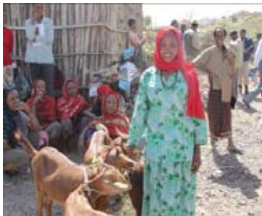
A beneficiary after receiving her goats in Bati town

already started returning the revolving loans in the form of mature offspring of the sheep and goats. This indicates the true spirit of revolving fund and a promising success to all targeted beneficiaries.