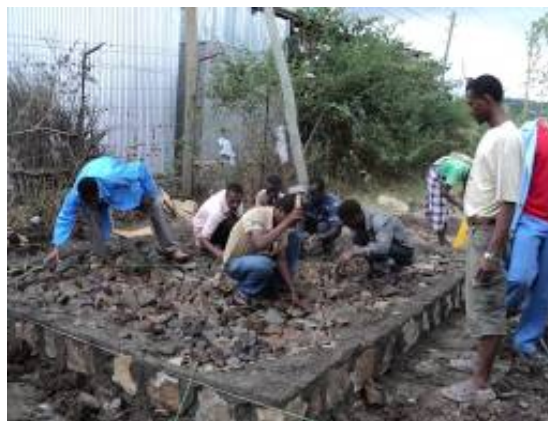
Students undertaking practical masonry training in

In partnership with Kemissie, Bati and Ataye Technical and Vocational Educational Training (TVET) colleges and Woreda Migration Taskforces, SLM Addis also supported local government and vocational training institutes in offering tailored short-term vocational skills training programs to vulnerable youth i.e. school drop-outs, illiterates and unemployed. IOM provided these TVET Colleges with materials required as inputs for the