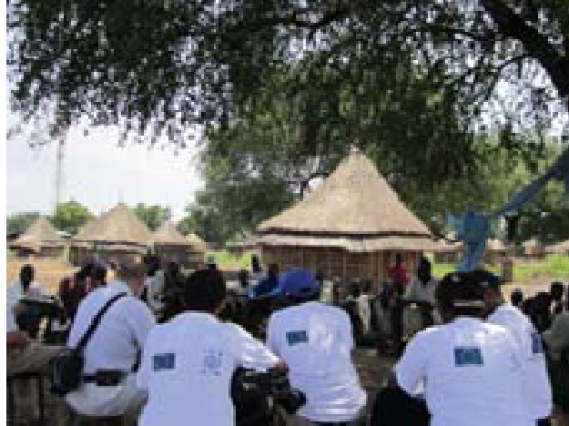
ECHO delegation and IOM Staff talk to IDPs in Lare settlement

On October 20 th , 2010 a team from the European Commission Humanitarian Office visited two IOM project sites in Lare and Itang weredas of the Gambella region. The delegates had a chance to talk to the displaced communities and gain an understanding of their situation. ECHO is currently funding the IOM project, 'Comprehensive response to IDPs in Gambella Regional State through improved data