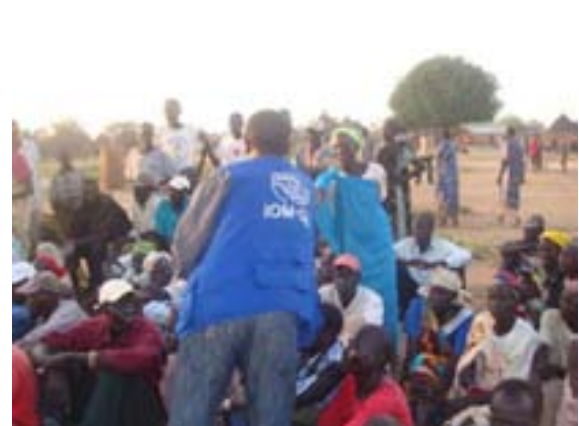
IDPs waiting to receive NFI Kit Vouchers