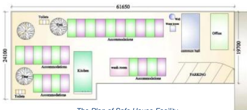
The Plan of Safe House Facility

Some GBV victims receive threats, including death threats, from the perpetrators and their associates. The Safe House initiative can provide physical safety for such victims. The Safe House activity is supported by Sida.