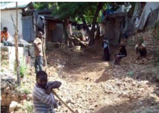
Drainage and footpath rehabilitation, Mangeoire, Port-au-Prince