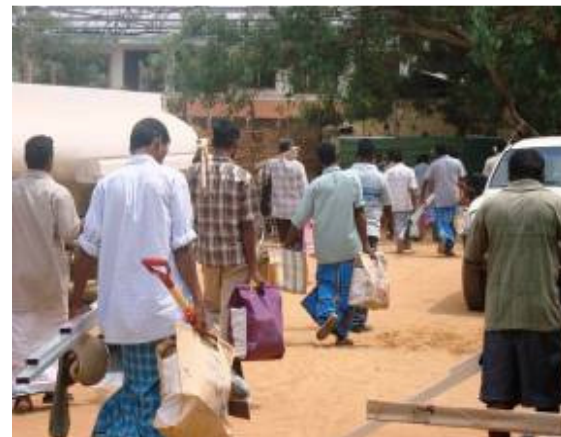
Recent returnees receiving IOM livelihood tools

Following a massive movement of internally displaced persons (IDPs) in late 2009 and early 2010, the International Organization for Migration (IOM) in coordination with the Government of Sri Lanka, local partners and the UN, began implementing a resettlement programme to help some 280,000 IDPs residing in Menik Farm displacement camp to return to their home districts in the north and east of the country and rebuild their livelihood.