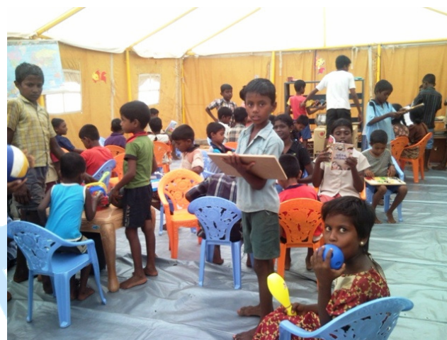
Children at the Psychosocial Support Centre.