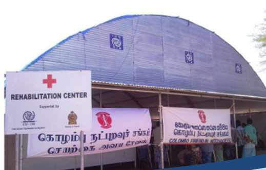
IOM Rehabilitation Centre.