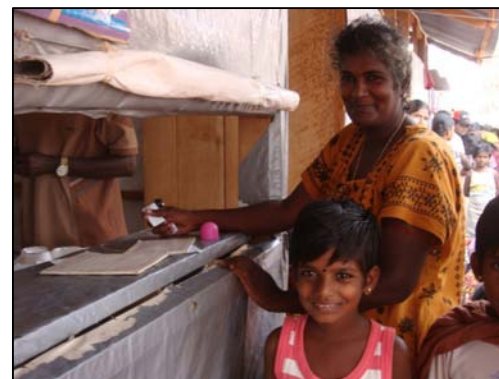
Waiting for medicine at a primary health clinic

IOM primary health care services in Sri Lanka include emergency humanitarian action, post-conflict health systems recovery, and migration health. Since the end of the conflict between the government and the LTTE in May 2009, IOM Sri Lanka in partnership with the Ministry of Healthcare and Nutrition (MOH), has provided emergency health care services to over 200,000 displaced people in northern Sri Lanka. IOM also plays a role in supporting MOH for primary health care related interventions in areas of return and in IDP (Internally Displaced Persons) camps.