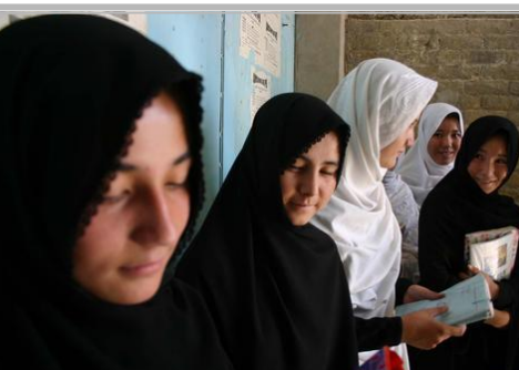
IRAN: Female electoral worker in Iran. IOM conducts out of country voting for Afghan refugees residing in Pakistan and Iran. The largest ever out-of-country registration and voting programme was entrusted to IOM, who implemented it on behalf of the Afghan Joint Electoral Management Body and the United Nations Assistance Mission in Afghanistan (UNAMA).