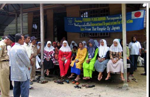
INDONESIA: Trainers from the sub-district animal husbandry office give insights to the participants during the duck husbandry training in Lancan Village, Junib, Bireuen, Indonesia. IOM's livelihood training targets women who may be vulnerable to human trafficking in tsunami-affected areas.