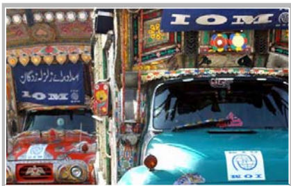
PAKISTAN: Local trucks form the backbone of IOM's earthquake relief logistics in Pakistan. As the lead agency of the Shelter Cluster of the Humanitarian Community that is responding to the South Asia Earthquake, IOM provides emergency shelter, logistics support and health services to the survivors of the October 8, 2005 earthquake in Pakistan. © IOM 2006 - MPK0023