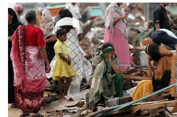
SRI LANKA: Women survivors are overcome with grief by the harrowing effects of the tsunami to their homes and their families. © Natalie Behring/IOM/OnAsia 2005 - MLK0009