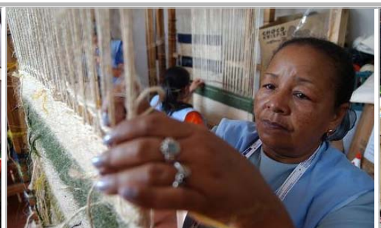
COLOMBIA: Luz y Vida is an Artisan Women's Association created by internally displaced Colombian women. Income generating activities are vital to the successful settlement of displaced populations. IOM works with its partners to find sustainable employment for displaced & vulnerable heads of households, to provide support in farming and raising livestock & in the creation of micro-enterprises. © IOM 2005 - MCO0021