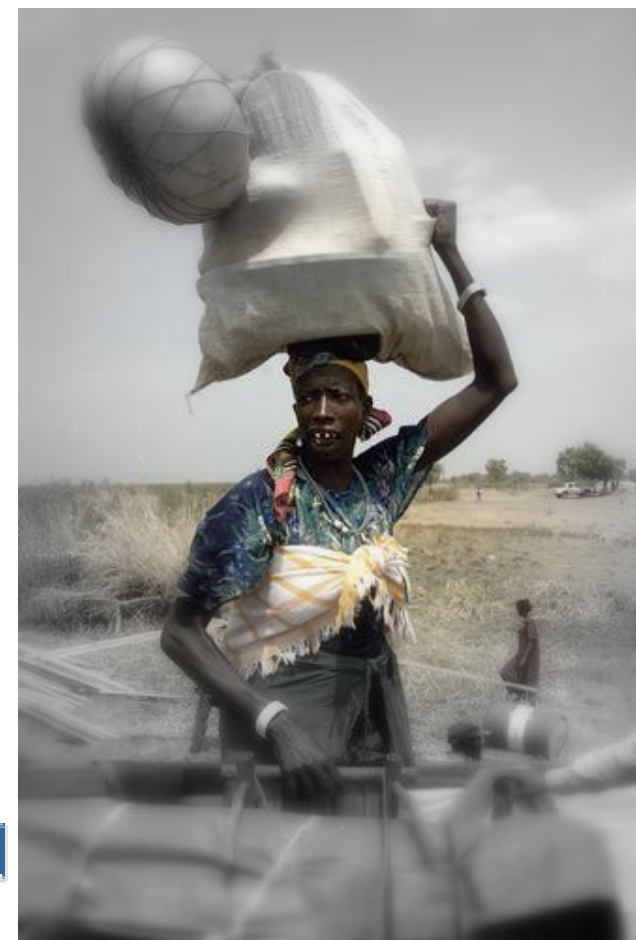
SUDAN: Arrival in Bor, disembarking. These Dinkas, one of the main tribes in Southern Sudan, were displaced from their homes during the long civil war which ended last year after a peace deal was signed between the government in Khartoum and the SPLA (Sudanese People Liberation Army).

Since 2005, IOM has been involved in the Cluster Approach taking a leading role in Camp Co-ordination and Camp Management in Natural Disasters as well as being key partners in Emergency Shelter, Logistics, Health, Protection and Early Recovery. The cluster approach, while not only, focuses largely on the gap area of internally displaced and is based on the premise that no one organization can carry out all the responsibilities in a displacement crisis.