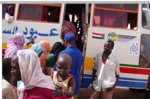
SUDAN: IOM is providing transportation assistance to Internally Displaced Persons (IDPs) who are currently being relocated from Abu Shouk camp in north Darfur, to Al Salaam, a new camp located a few kilometres away. Other than providing transportation assistance, IOM is also responsible for ensuring newly arrived IDPs are registered on the IDP database.