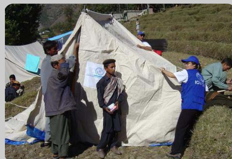
PAKISTAN: IOM staff pitch camp in Bana, located in Pakistan's remote Alai district. As Cluster lead agency, IOM provides emergency shelter, logistics support and health services to the survivors of the October 8, 2005 earthquake in Pakistan.

IOM also assists with customs clearance, database management and tracking of relief items. Logistical support is also necessary for the safe and dignified return of IDPs. IOM provides logistical support for returns programmes and activities. This includes undertaking road assessments prior to return.