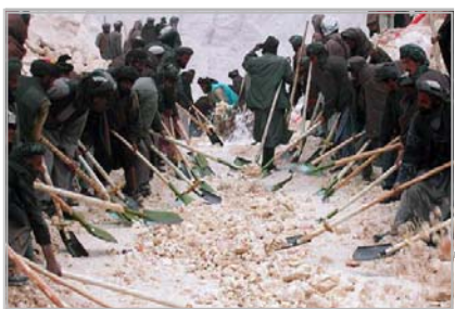
AFGHANISTAN: Afghan IDPs work to clear a river blocked during an earthquake in Northern Afghanistan. IOM provided the shovels and logistical support to aid in the return of water to the community.