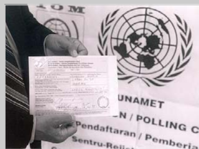
CHINA: Voters began showing up at the polling station at 7:30 a.m. although the balloting centre was not due to open until 9:00 a.m. By the time the polls closed 94 percent of the registered voters had voted. Macau Special Administrative Region. MMO0003