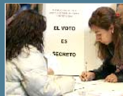
1. In-country voting in Ecuador is compulsory for all citizens