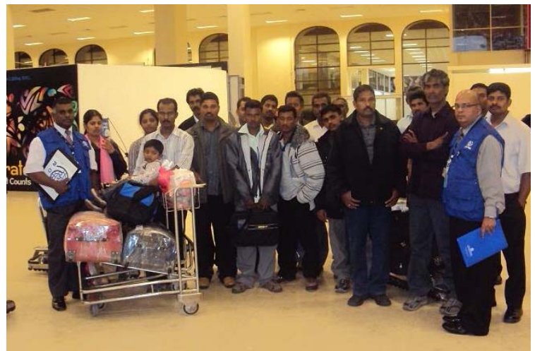
20 Sri Lankans migrants arriving home