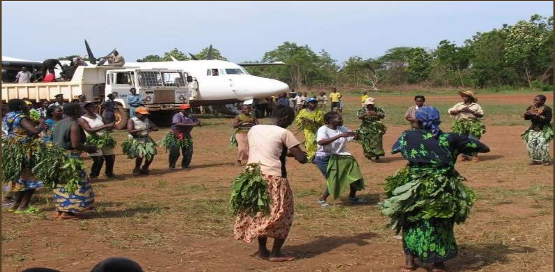
Refugees dancing on arrival in Yambio, Western Equatoria in 2006

Where UNHCR has no presence, IOM assists UNHCR with onward transport to final destinations