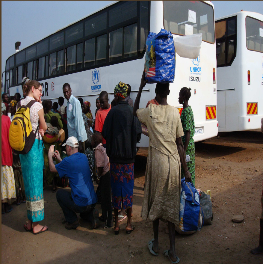
15,000 refugees returned from Ethiopia to South Sudan and BNS