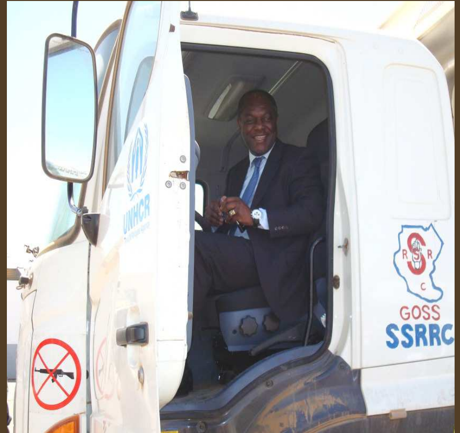
15 Hino Trucks donated by the SSRRC to facilitate repatriation of refugees to South Sudan 9