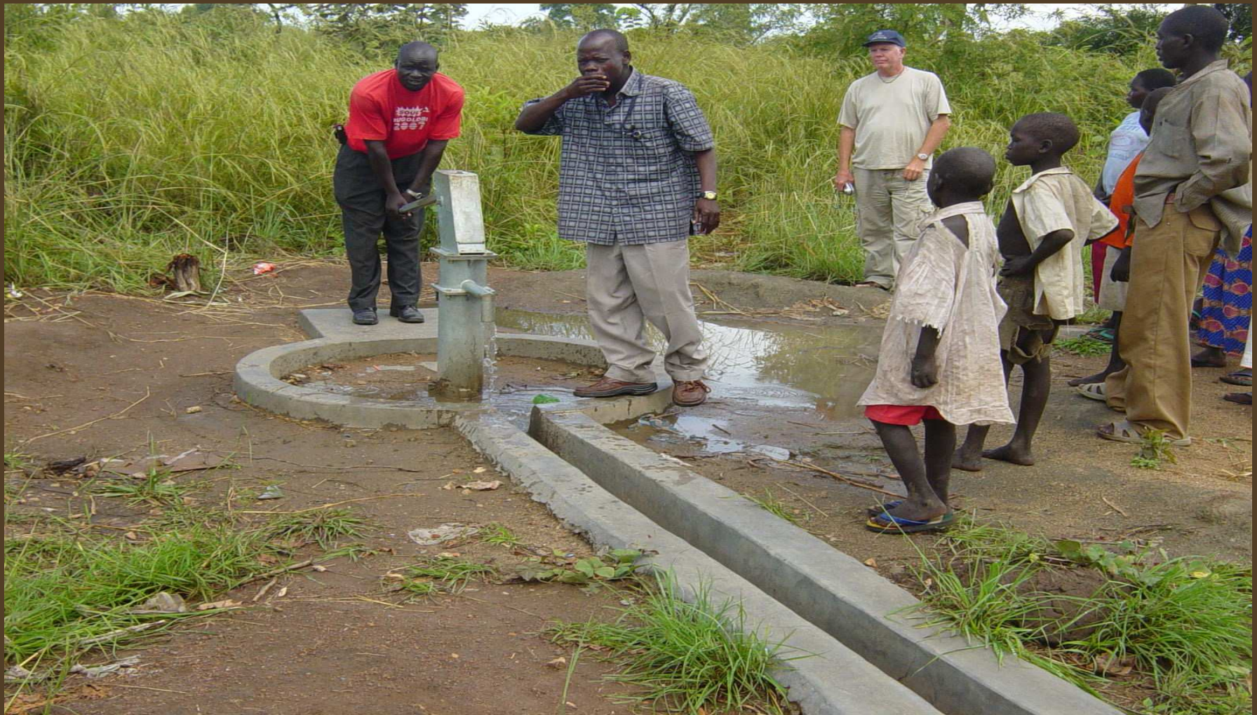
Bore-hole in Kuda village, South Sudan

Bore-hole constructed through Bill & Melinda Gates Foundation