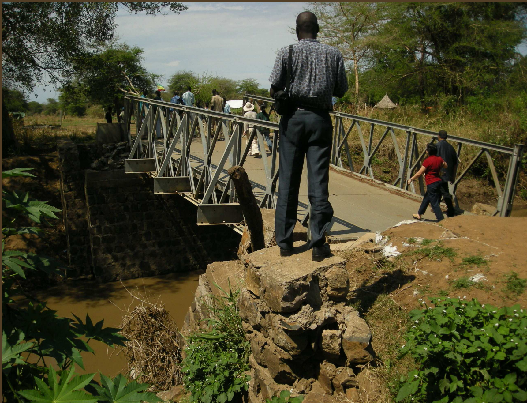
Collapsed bridge hinders repatriation through the Ethiopian corridor (Pagak bridge)