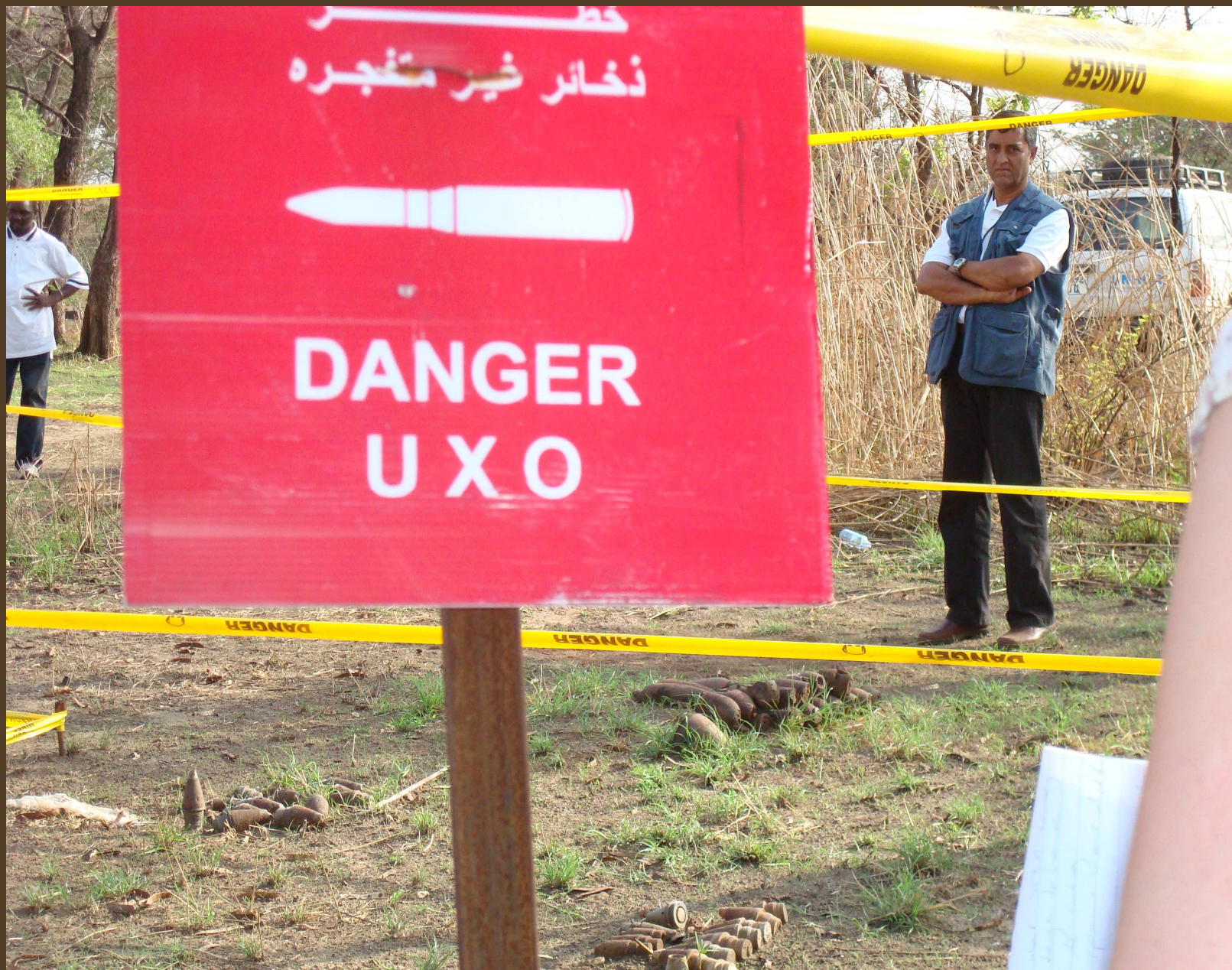
Demining efforts and Mine Awareness campaigns continue