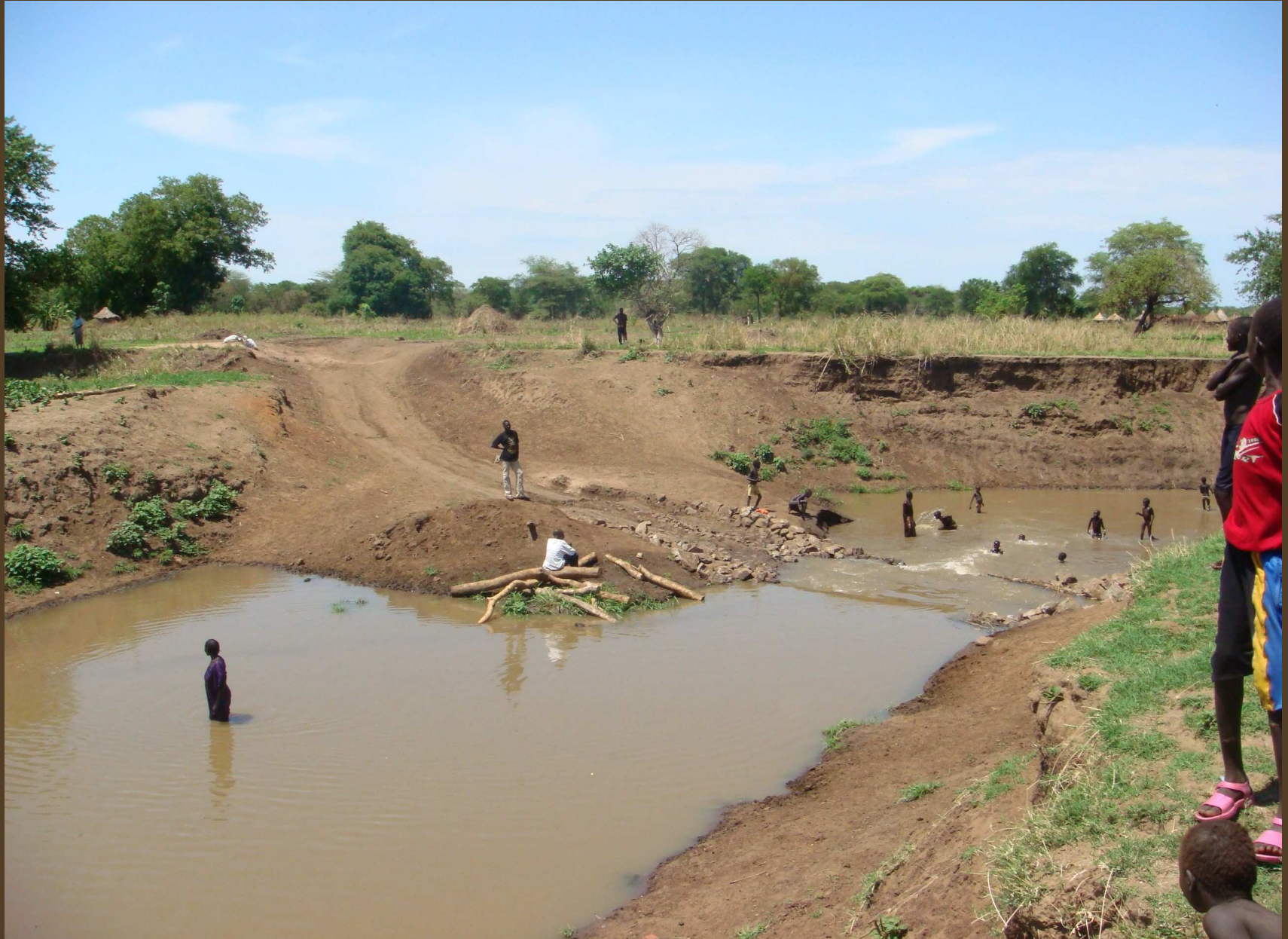
Difficult and impassable road conditions