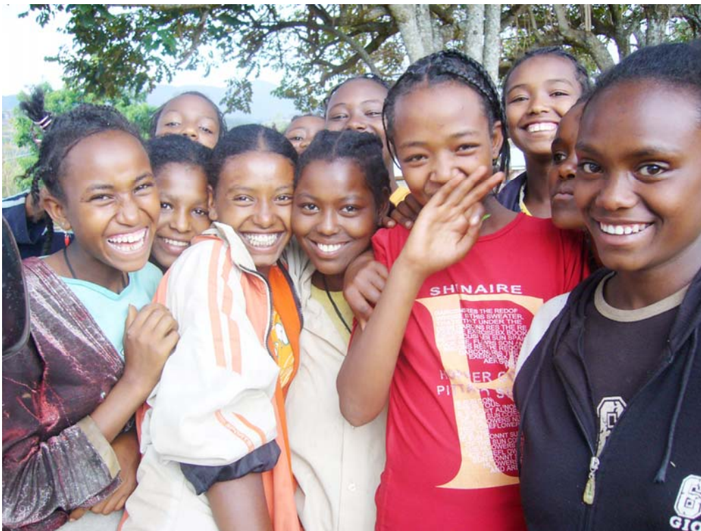
First generation of girls who do not have to undergo FGM in Kembata, Duram Woreda, Ethiopia