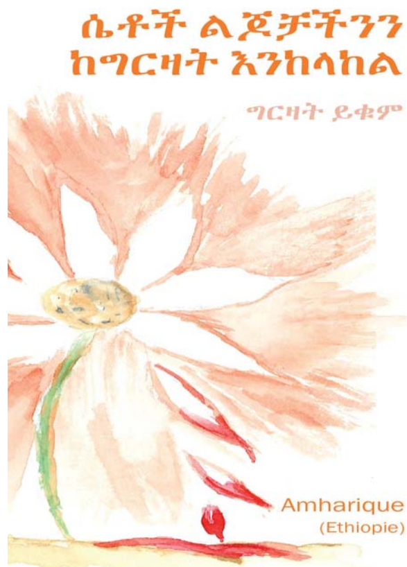
"Let's protect our girls from excision, STOP FGM": Brochure published within the framework of the project in Geneva, in Amharic (Ethiopia) and other migrant communities' languages

In the canton of Geneva , in Switzerland, IOM, in collaboration with the Department for the Promotion of Equality between men and women, and with contribution from other State departments in charge of health, integration and youth, has developed a project targeting populations from Ethiopia, Eritrea, Somalia and Sudan. The project aims at raising awareness and knowledge of community members of the legal ban of FGM in Switzerland and of the consequences on FGM on women's health. Cultural mediators from the various communities have been recruited and trained to act as an agent of sensitization.