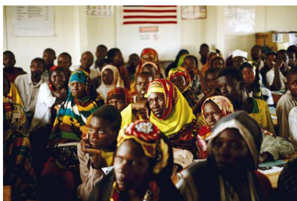
Somali refugees attending a CO course in Kenya

IOM became increasingly concerned and aware of the practice of FGM when the numbers of African women refugees requiring health assessments for resettlement began to rise. 10 The organization therefore started to address the issue within the framework of its integration activities. Through pre-departure cultural orientation courses, IOM advocates against FGM among groups preparing to resettle. This is where migrants first learn that the practice is banned in Europe and Northern America.