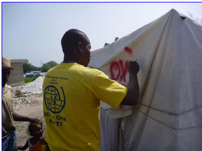
IOM registration staff marking the tent during token distribution in Grand Goâve.