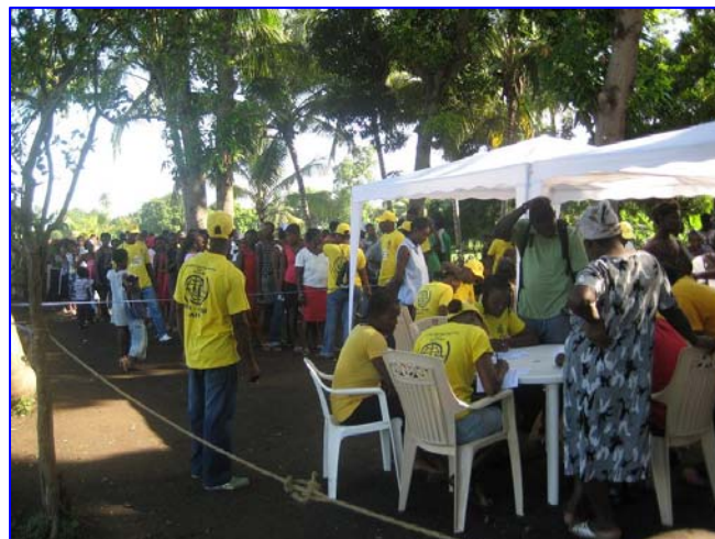
Registration activities in Léogâne.

The registration process can be viewed as servicing four overlapping phases beginning with emergency assistance through to recovery: