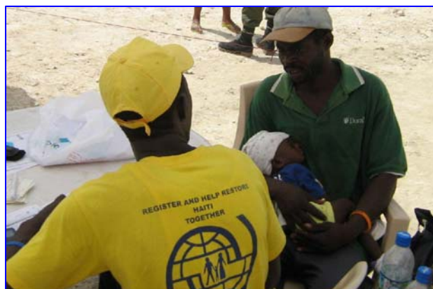
Head of household holds his baby while being registered by IOM's Registration staff in Terrain Toto.

The primary goal of the registration process is to establish the identities of internally displaced persons (IDP) through detailed data collection at the individual and household level. Registration took place in a phased way, beginning with emergency assistance through recovery.