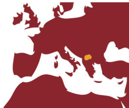
Graphic courtesy of Mine Action Information Center

provisions of the Criminal Code on confiscation of property/proceeds, as well as of provisions of the Law on Court Execution 5 in cases when the compensation claim is granted. Unfortunately, these provisions are often lengthy and complicated. With the 2006 Criminal Code amendments, it became obligatory to make a decision on