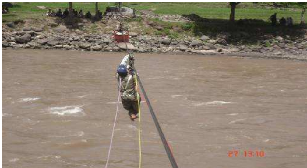
Fig 8.4 ERT going to help men stuck in cable car