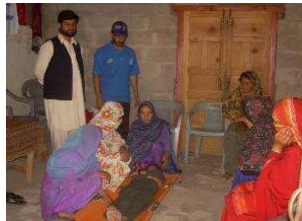
Fig 8.6 ERT Bagh Engaging the community in training