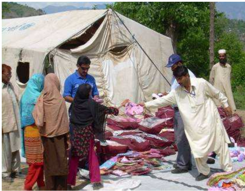
Fig 8.2 ERT Muzaffarabad at a beneficiary distribution in IDP camp

ERTs continue to expand the networks of first responder community level trainings, lead assessment ventures and response to difficult emergency situations in harsh conditions.