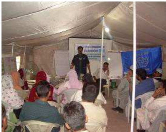
Fig 8.5 ERT Hattian during NGO Training