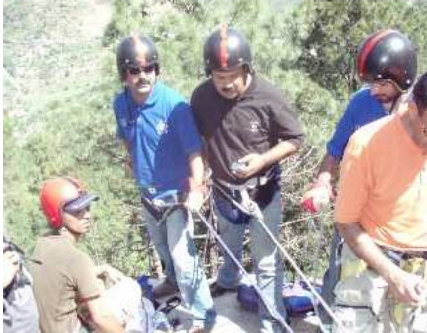
Fig 8.7 ERT during Training with Alpine Club of Pakistan

The remainder of ERT members who did not participate in last months mountaineering and search and rescue training completed the one week training with the Alpine Club in the first week of April.