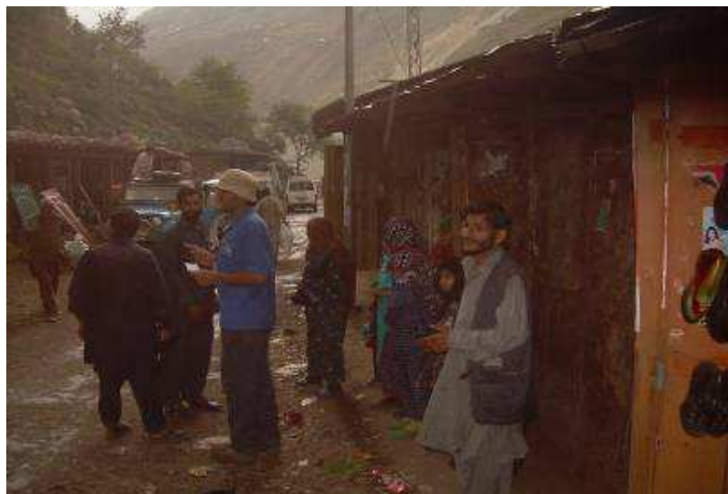
Fig 8.1 ERT Neelum Valley Assessing Areas of origin for repatriation of returning IDPs

The ERTs have continued to focus on assessments and trainings through the month of April. Visibility and awareness of government/humanitarian/earthquake-affected communities to team programs and services has been continuously raised through brochures and newspaper advertisements. Team linkages with communities through first responder trainings and information campaigns have increased incoming requests for assessments, training and emergency assistance.