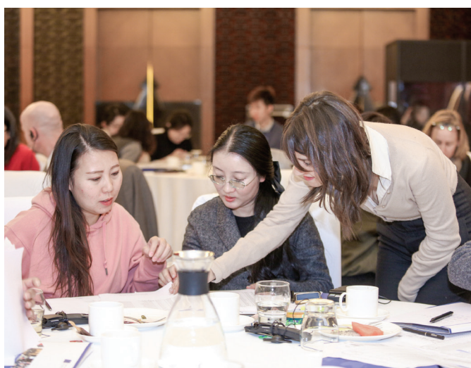
Participants engage in interactive exercise during the Training Course for EU MS and Schengen on Trends related to fraudulent visa