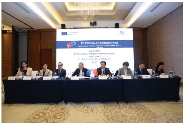
Representatives from IOM, EU, Ministry of Foreign Affairs delivering opening remarks at the MMSP II launch event