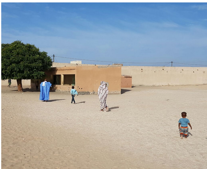
© OIM - In the courtyard - Mahadras, Nouakchott