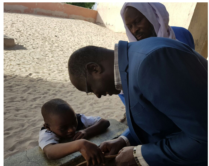
Time to write on a wooden shelf - Mahadras, Nouakchott

North Africa is characterized by complex migration-related scenarios, including movements to, from and within the region. This complexity is further accentuated by the so-called “mixed migratory flows”. There are irregular migrant’s flows mainly caused by economic factors both across North Africa and from Africa to reach Europe.