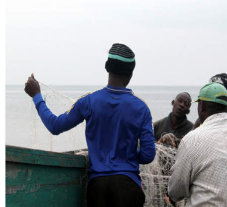
In Uganda, some 130,000 people live in fishing communities and estimates suggest that HIV infection rates in these communities are almost 3-4 times higher than the national average for adults.

Where possible, IOM supports the integration of HIV into primary healthcare, SRH and TB services to ensure people who are living with or are at high risk of HIV have access to comprehensive and integrated HIV and health services. In Myanmar, IOM supported combined HIV-TB services at community level allowing for increased testing of TB patients for HIV and provision of home-based care packages for co-infected persons. In several emergency settings (including South Sudan, Sudan and Lebanon), IOM supported the delivery of essential HIV services through primary health programmes for IDPs and refugees at fixed and mobile clinics using community health workers. In Lesotho, Malawi, Mozambique, South Africa, Swaziland and Zambia, IOM supports the roll out of a minimum SRH package in health facilities servicing MMPs. This package includes family planning, HIV and STI prevention and treatment, antenatal care, sexual health and prevention of SGBV and harmful cultural and traditional practices in surrounding communities.