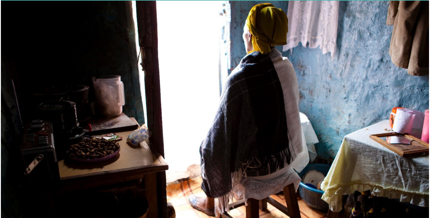
A HIV-positive female sex worker quietly reflects on her move from Tanzania to Kenya in search of a better life as she awaits clients.