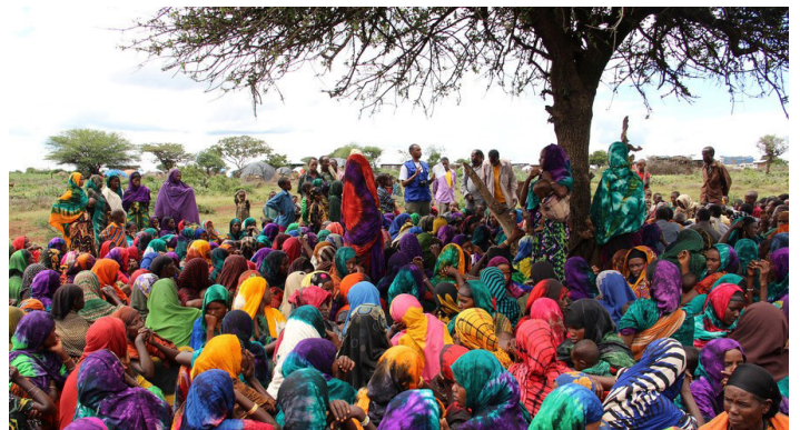
IOM is conducting mass awareness raising on gender and HIV-AIDS in Ethiopia.

In 2017, IOM was implementing HIV-specific projects in 9 out of the 35 UNAIDS listed Fast-Track Countries, namely: Myanmar, South Sudan, Uganda, Malawi, Mozambique, South Africa, Swaziland, Zambia and Lesotho.