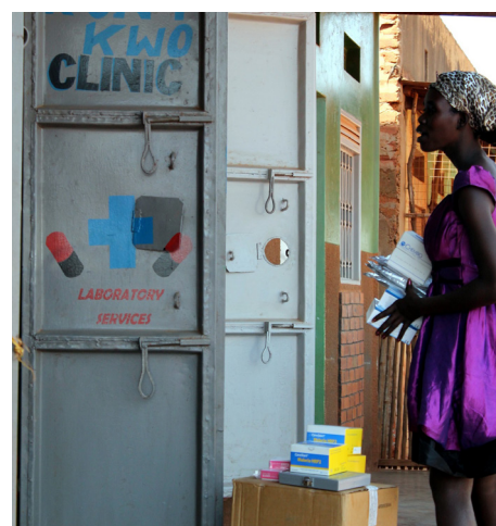
IOM is distributing medical and laboratory equipment to health clinics located in HIV hotspots in Uganda.

These are geographical areas where human mobility creates an environment conducive to increased health risks in a community. They can include places where MMPs live, work, pass through or originate from. By identifying such spaces, IOM is able to deploy resources to reach at-risk-populations. In Uganda, for example, IOM used a 'Spaces of Vulnerability' approach to expand testing among adolescents and young people in hotspots along the main transport corridor and in major mining areas. Activities under this initiative included the provision of 'moonlight services' where clinic hours were extended to encourage testing and treatment uptake, and outreach and community mobilization events that engage the broader community in prevention efforts.