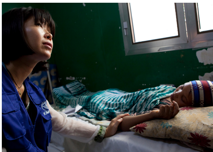
IOM is working across Somalia addressing trafficking in persons, sensitizing at-risk populations on HIV and sexual and gender-based violence, and providing vital livelihoods training.