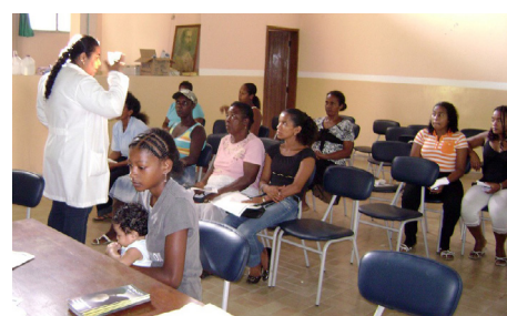
A medical staff provides training on treatment and prevention of Sexually Transmitted Diseases (STIs) and HIV/AIDS, as part of IOM's Emergency Assistance Programme for Persons in Search of International Protection, which covers Colombia's borders with Ecuador, Panama, and Venezuela.

In the Caribbean region, IOM worked with the Pan Caribbean Partnership against HIV/AIDS (PANCAP) to improve access to HIV services for MMPs. IOM is also the secretariat of the Joint United Nations Initiative on Migration, Health and HIV in Asia (JUNIMA) which promotes universal access to HIV prevention, treatment, care and support for MMPs in Asia.