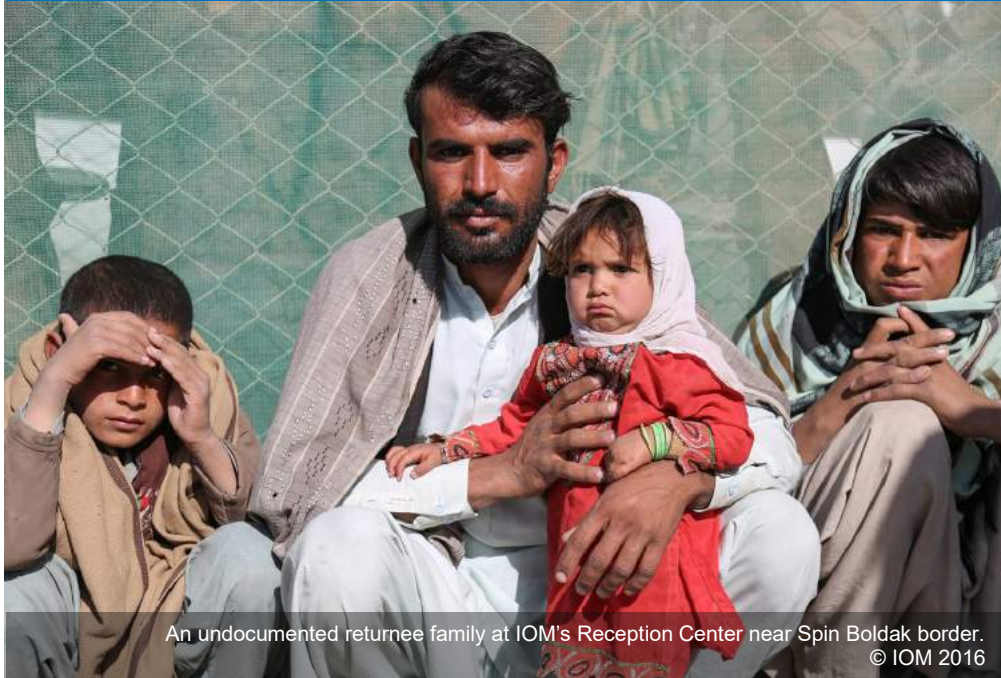
An undocumented returnee family at IOM's Reception Center near Spin Boldak border.