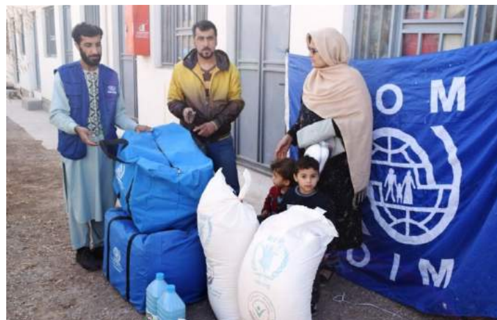
A returnee family receives food and NFIs at the Transit Center in Herat.

IOM provided post-arrival humanitarian assistance to 232 (2.4%) undocumented Afghans arriving from Iran at its Transit Centers in Herat and Nimroz provinces. According to the DoRR Border Monitoring Team, approximately 10% of undocumented Afghans returning from Iran are in need of humanitarian assistance.