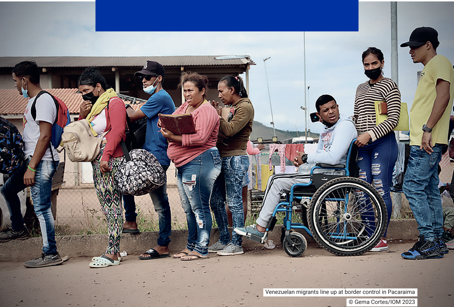
Venezuelan migrants line up at border control in Pacaraima