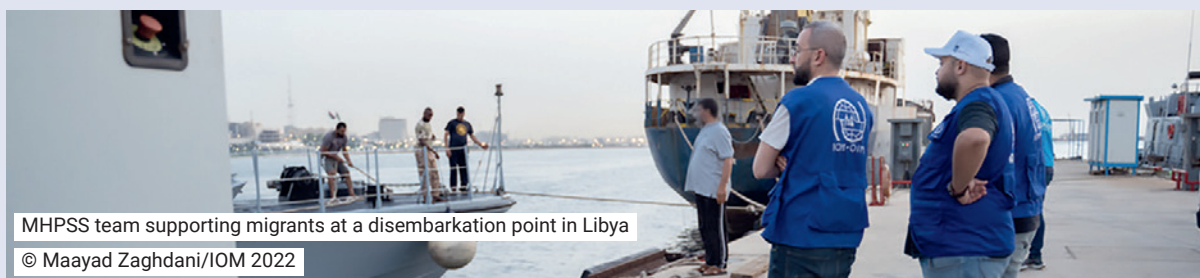
MHPSS team supporting migrants at a disembarkation point in Libya

IOM Libya PMTs provide psychological first aid and supportive communication to migrants intercepted at sea, doing so at Libyan disembarkation points in an integrated manner through IOM health, direct assistance, and protection teams. The MHPSS teams provide services to migrants in distress as many migrants express their concerns as to their feelings of fear, neglect, refusal, shame, worry about their family members, uncertainty about the future and mistrust as well as a fear of violence and exploitation, stigmatization and discrimination. The migration journey and failure to reach their planned destination affects their views on the world and their lives.