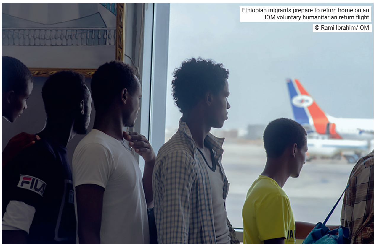
Ethiopian migrants prepare to return home on an IOM voluntary humanitarian return flight

Migrants that fall into the following groups have been frequently considered by IOM to be at heightened risk due to their vulnerability: chronically ill migrants, migrants with significant medical conditions, victims of trafficking (VoT), victims of exploitation, victims of abuse and violence, the elderly, unaccompanied migrant children, single-headed households, female-headed households and pregnant women. 1