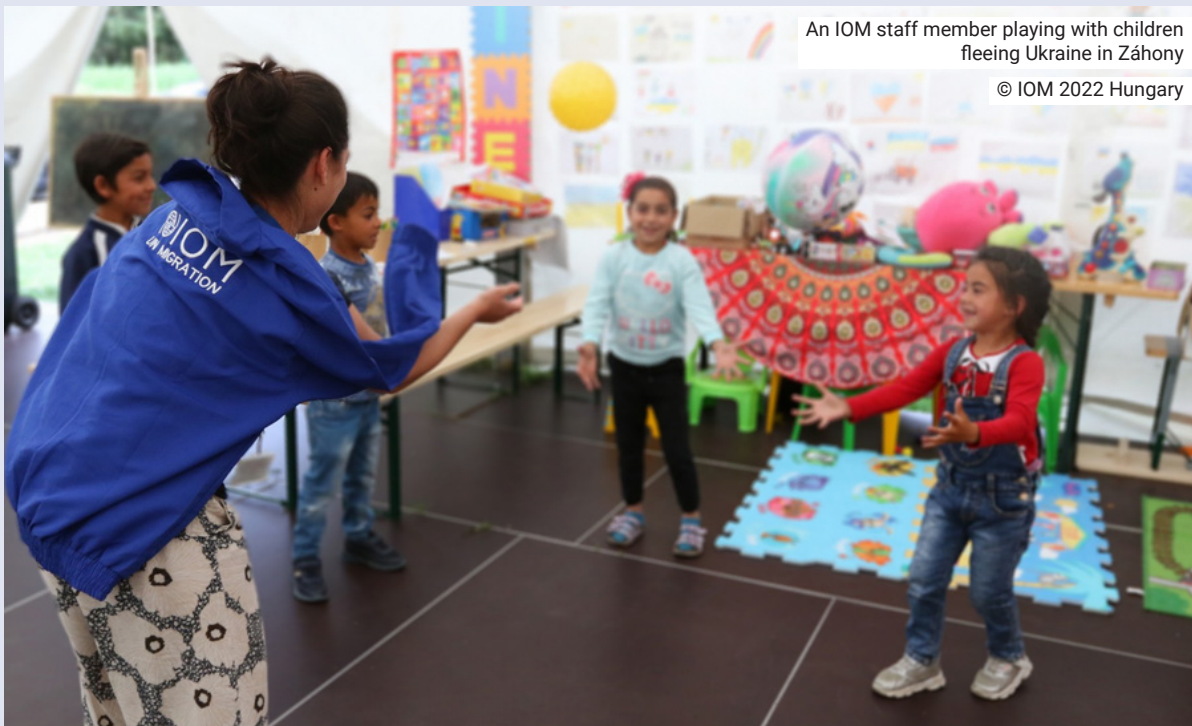
An IOM staff member playing with children fleeing Ukraine in Záhony

IOM Hungary in cooperation with Záhony Town Hall has opened a child-friendly space in Záhony Railway Station, at the border crossing point with Ukraine. It was created in response to the Russian invasion of Ukraine in February 2022. The child-friendly space consists of a substantial area, and has different toys, board games, tools for drawing and a small playground for outdoor activities. Most of the time, a kindergarten teacher is present to play with newly arrived children and families. As people in the train station are in transit, the use of the safe space varies.