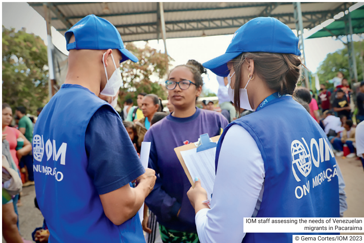
IOM staff assessing the needs of Venezuelan migrants in Pacaraima

2017. Manual on Smart Practices for Working with Migrant Unaccompanied and Separated Children in the Europe Region . Geneva.