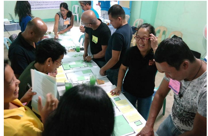
Participants actively engaged in group exercise