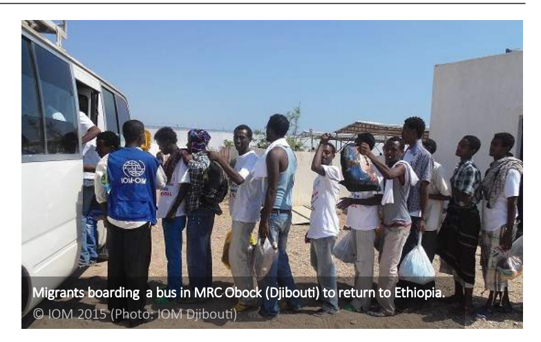
Arrivals in Somalia

On 16 September, IOM in Djibouti coordinated with counterparts in Ethiopia to facilitate the Onward Transportation Assistance (OTA) for 69 Ethiopian migrants including 15 unaccompanied minors to Addis Ababa.