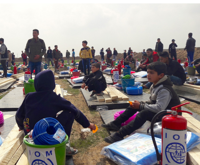
Above: IOM Iraq distributed 295 Sealing-off Kits (SoKs) to internally displaced Iraqis (IDP) in Hammam Al-Alil. These kits include items that can be used to repair or upgrade damaged/unfinished buildings. IOM Iraq has distributed 14,000 SoKs in response to the Mosul displacements since October 2016 with support from CERF, OFDA, and ECHO.