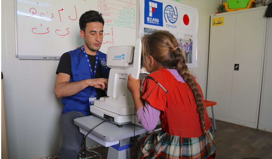
Above: IOM's mobile medical team provides eye-care support to displaced children in Hassan Sham Camp, east of Mosul. The process involves primary screening of children in schools and child-friendly spaces in the camps, followed by specialized eye checkups for those identified with ophthalmologic issues, and then the prescription of eyeglasses. Finally, the children will be provided with eyeglasses based on the prescription. The eye-care activities are supported by the Government of Japan and Fuji Megane Co.