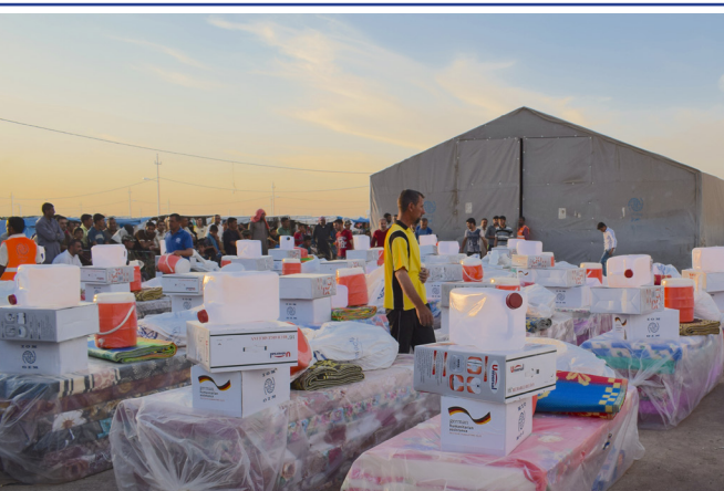
Above: IOM distributed non-food item kits to newly arrived displaced families from Mosul. The summer kits include necessary items such as mattresses, blankets, carpets, rechargeable fans, cool boxes, hygiene kits, and other items. The kits were funded by the Government of Germany.