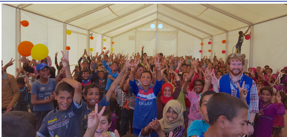
Above: IOM is scaling up its psychosocial (PSS) activities in Qayara and Haj Ali emergency sites by opening two new PSS centers, in addition to the five currently operating PSS centres in Chamakor, Nargizliyah, Hassan Sham camps and Haj Ali and Qayara emergency sites. These two new centres, funded by the Government of Canada, will provide PSS services to hundreds of displaced children.