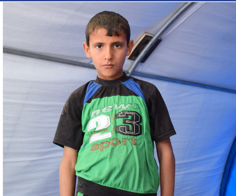
Right