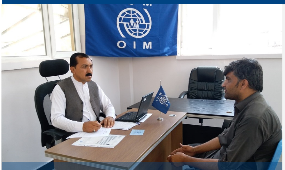
IOM CBRR staff conduct Socio- Economic survey with undocumented family head at TTC