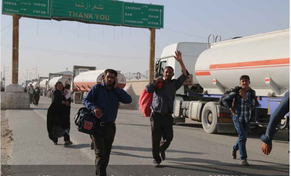
Deported Migrants crossing from Iran into Afghanistan