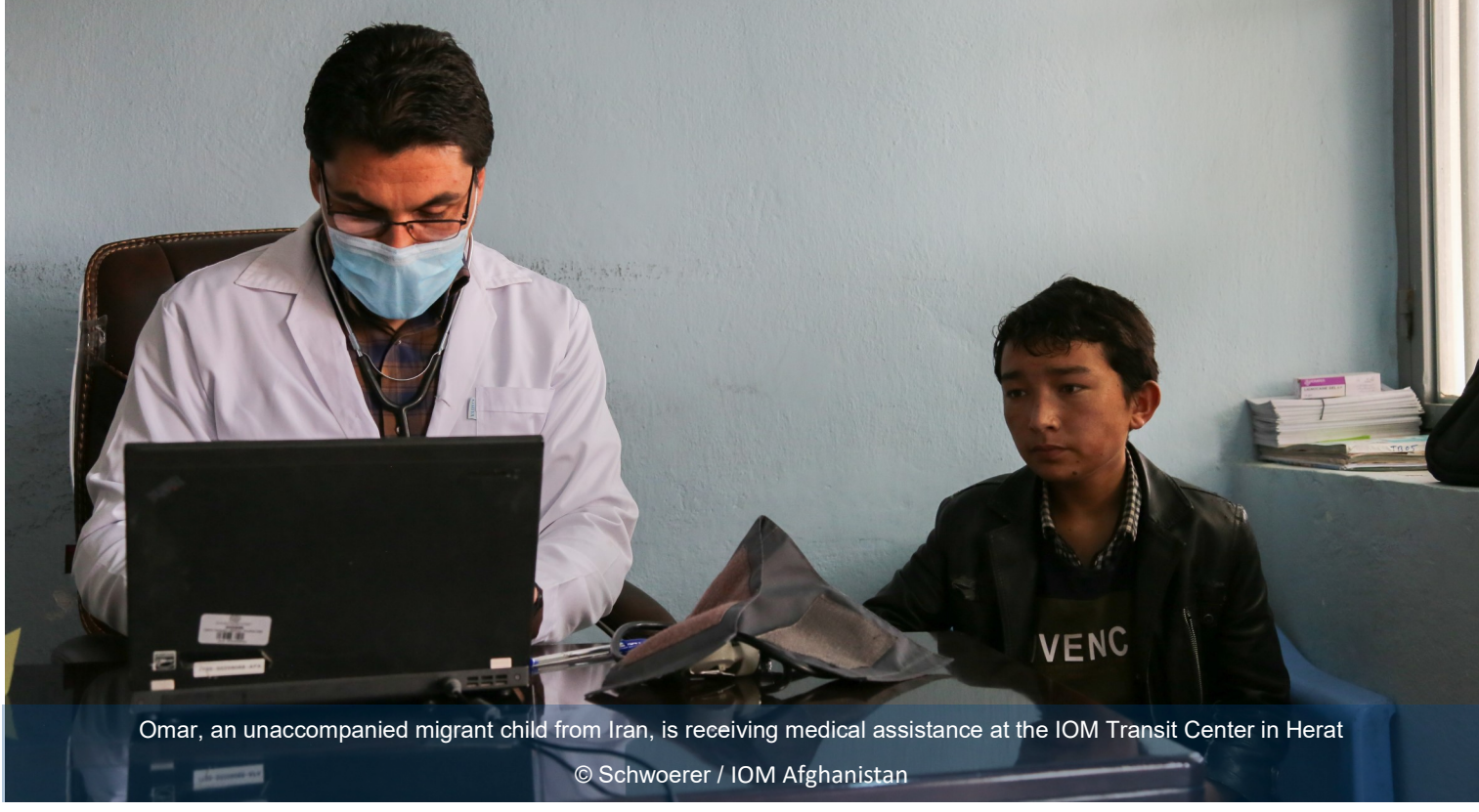
IOM Afghanistan has assisted 28,079 undocumented Afghans returning from Iran and Pakistan since 01 January 2018, thanks to the dedication of our staff and the generosity of our donors.