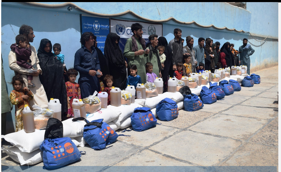
Afghan returnees from Iran receive assistance at the IOM Transit Center in Zaranj City, Nimroz province