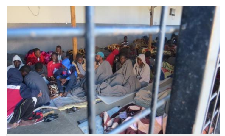
Migrants in Abu Sleem keep warm with blankets provided through IOM © IOM partner—Multkana, Tripoli 2016

Through a local partner partners, IOM Libya distributed 400 Non Food Items (NFIs) and Hygiene Kits to newly arrived migrants in Abu Sleem Detention Centre. These activities help to meet minimum and dignified shelter and NFI needs for vulnerable migrants in need of assistance. Activities and kit compilation takes into account the different needs of each gender and any vulnerabilities.