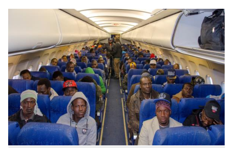
Migrants on the airplane returning home to Burkina Faso

More information can be found at https://www.iom.int/news/iom-assists-sub-saharan-migrants-stranded-libya-their-return