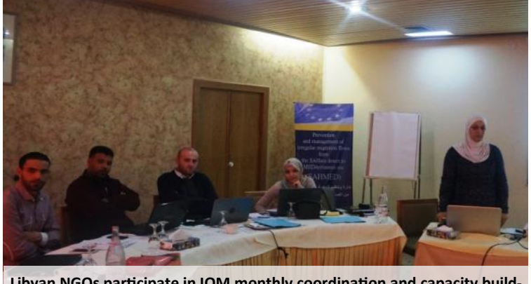
Libyan NGOs participate in IOM monthly coordination and capacity building meeting