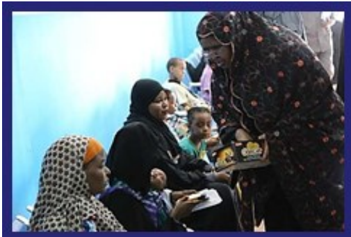
The First Lady hands out refreshments.

Due to the limited space within the Airport, it's been difficult to place adequate human resources to the operation. There is an urgent need to set up a medical station to evaluate and assist returnees in need of