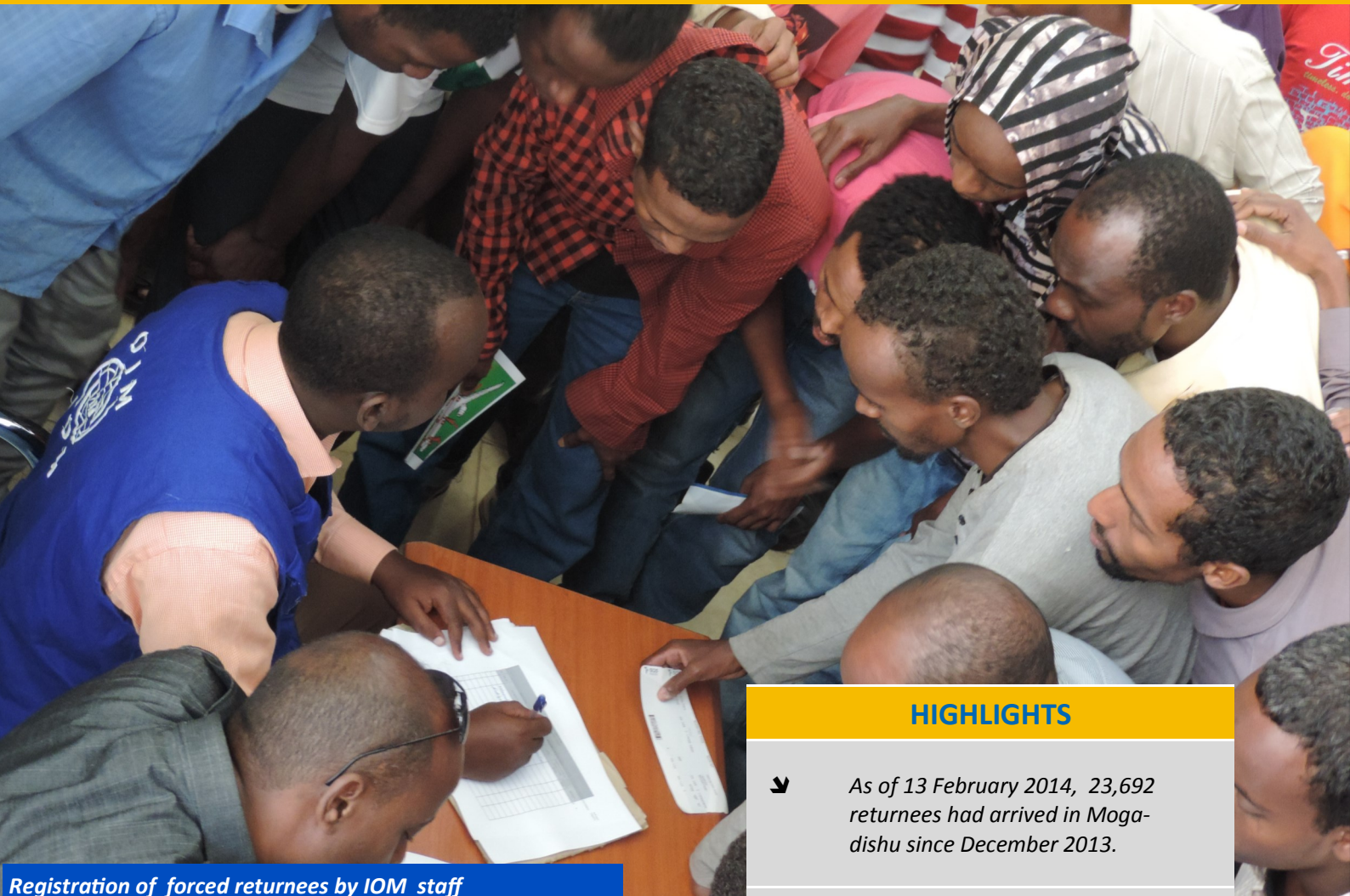
Registration of forced returnees by IOM staff