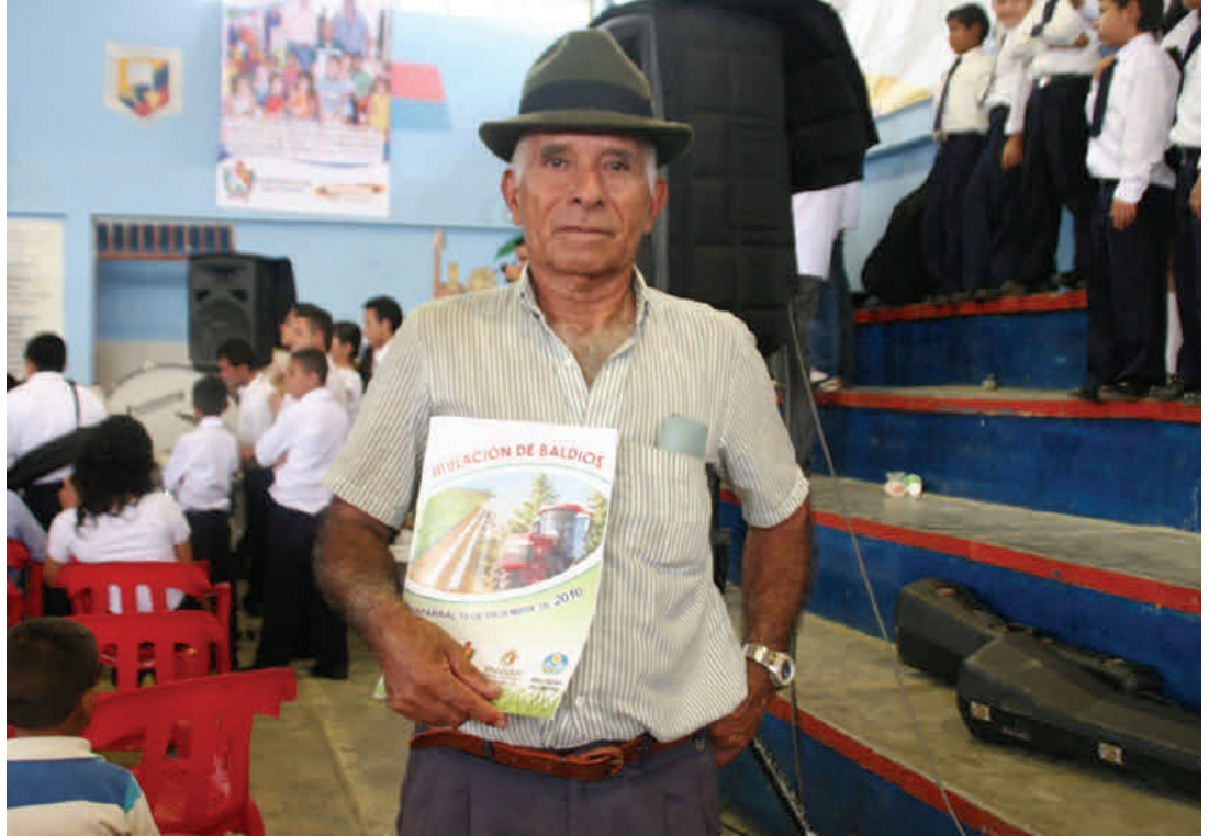
Land Formalization - Chaparral, Colombia.