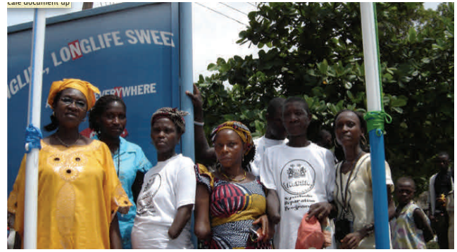
Community Symbolic Reparations Event in Makeni, Sierra Leone, 2009.