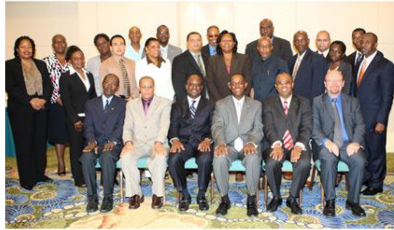
Delegates at Caricom Heads of Social Security Organizations meeting in The Bahamas

CONSIDERING- that one of the aims of the Caribbean Community is the fostering of unity among its members by functional cooperation in the areas of social security