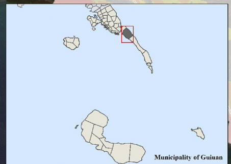
Municipality of Guiuan

Data Sources: Nationwide Operational Assessment of Hazards National Mapping Resource and Information Authority