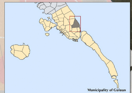
Municipality of Guiuan

Data Sources: Nationwide Operational Assessment of Hazards National Mapping Resource and Information Authority