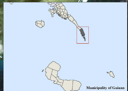
Municipality of Guiuan

Data Sources: Nationwide Operational Assessment of Hazards National Mapping Resource and Information Authority