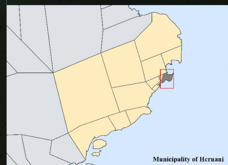
Municipality of Hernani

Data Sources: Nationwide Operational Assessment of Hazards National Mapping Resource and Information Authority