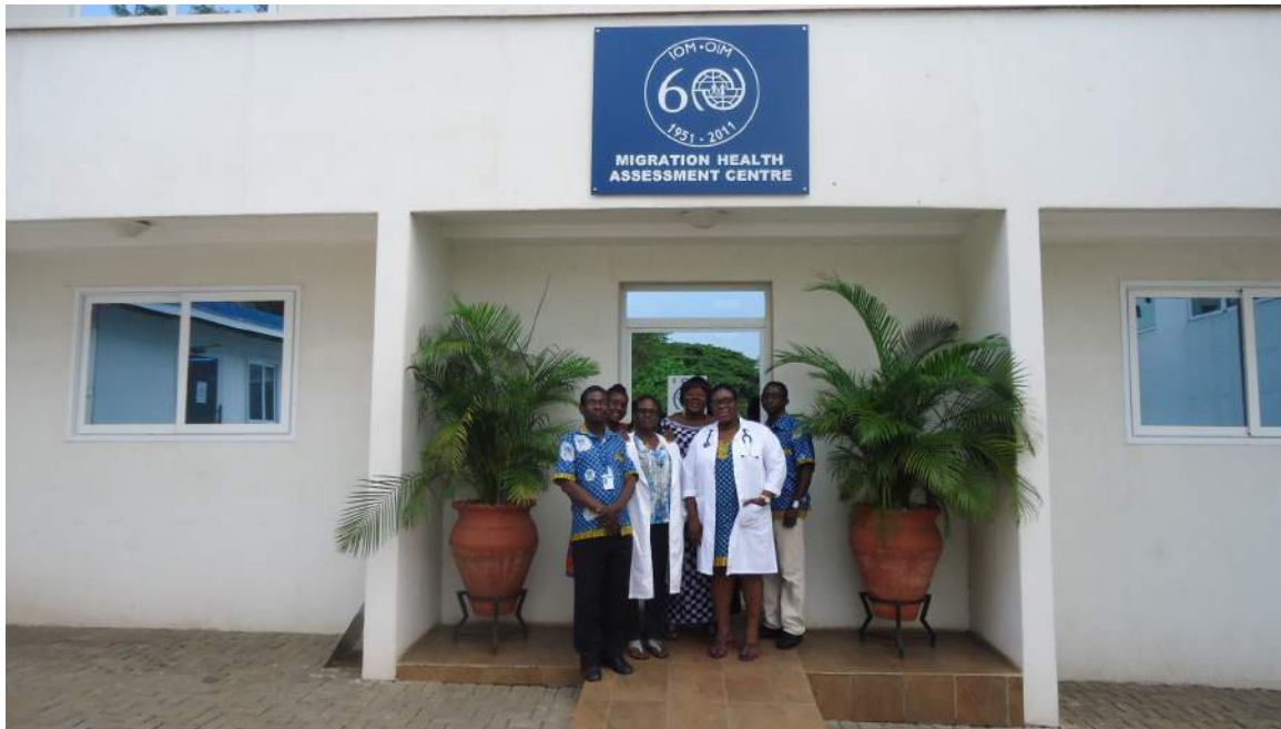
The IOM health team outside the Migration Health Assessment Centre (MHAC).