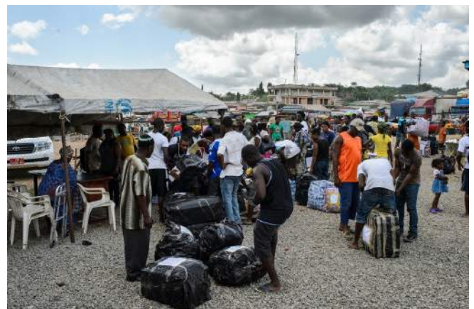
Above: Liberian refugees prepare to leave Budumburam refugee camp.

IOM Ghana's operation team coordinated all aspects of