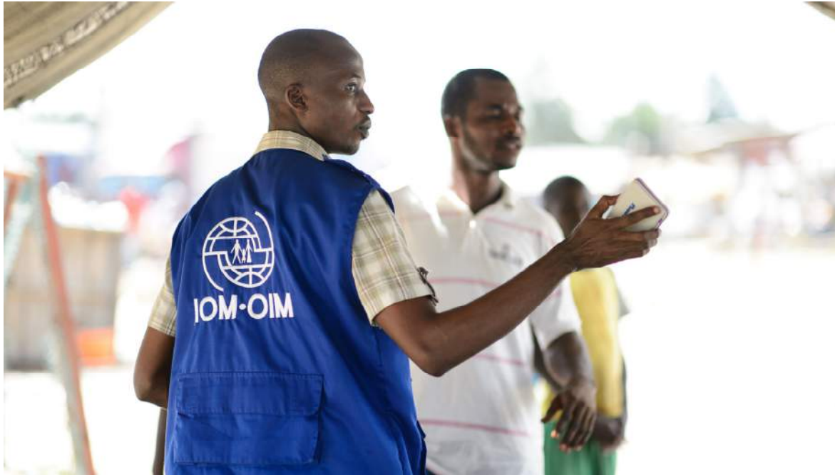
IOM staff provide instructions about registration and transportation.