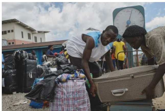
Above: Luggage is weighed and tagged prior to departure.

On 14 December 2012, IOM assisted the final group of former Liberian refugees to return to Liberia. It marked the end of a successful operation in which a total of 2,843 Liberian nationals returned home. IOM remains committed to assisting other Liberian refugees in Ghana who were unable to return due to medical or other personal reasons.