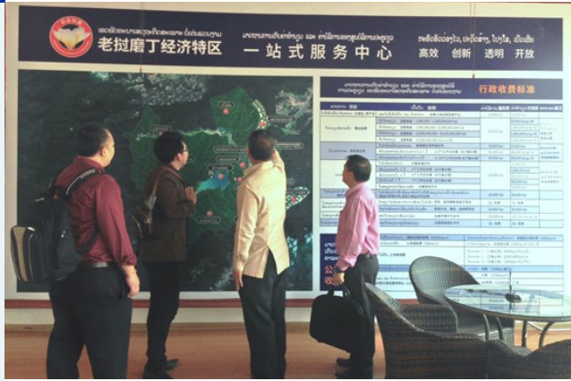
Boten Beautiful Land Special Economic Zone in Luang Namtha

Due to development plans and the increasing number of foreign workers in the Northern SEZs, foreign companies and the Government of Lao PDR are interested in working together to develop a future plan of cooperation in reducing instances of irregular migrant labour by ensuring workers have the proper permits and documents to work in Lao PDR. Labour management within the SEZs is also a key concern, to ensure companies are following Lao labour law and ensuring worker rights.