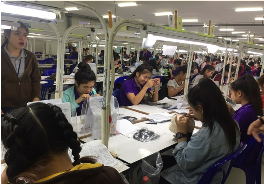
Factory workers in Savan-Seno Special Economic Zone