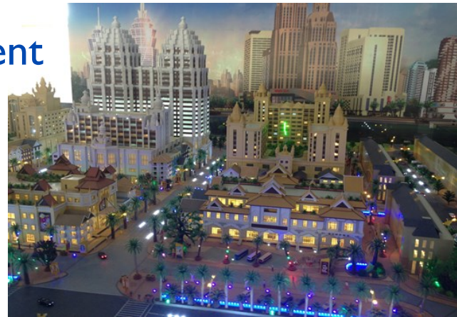
Model of future development in Boten Beautiful Land SEZ

Boten SEZ development plans hope to increase inhabitants to 300,000 in the near future, this SEZ will be focusing on trade and tourism, while sustaining Boten's natural mountainous environment. With these plans for expansion, SEZ authorities are concerned with labour management of foreign workers, along with protecting Lao workers who have lower skills and experience in the industrial sector.