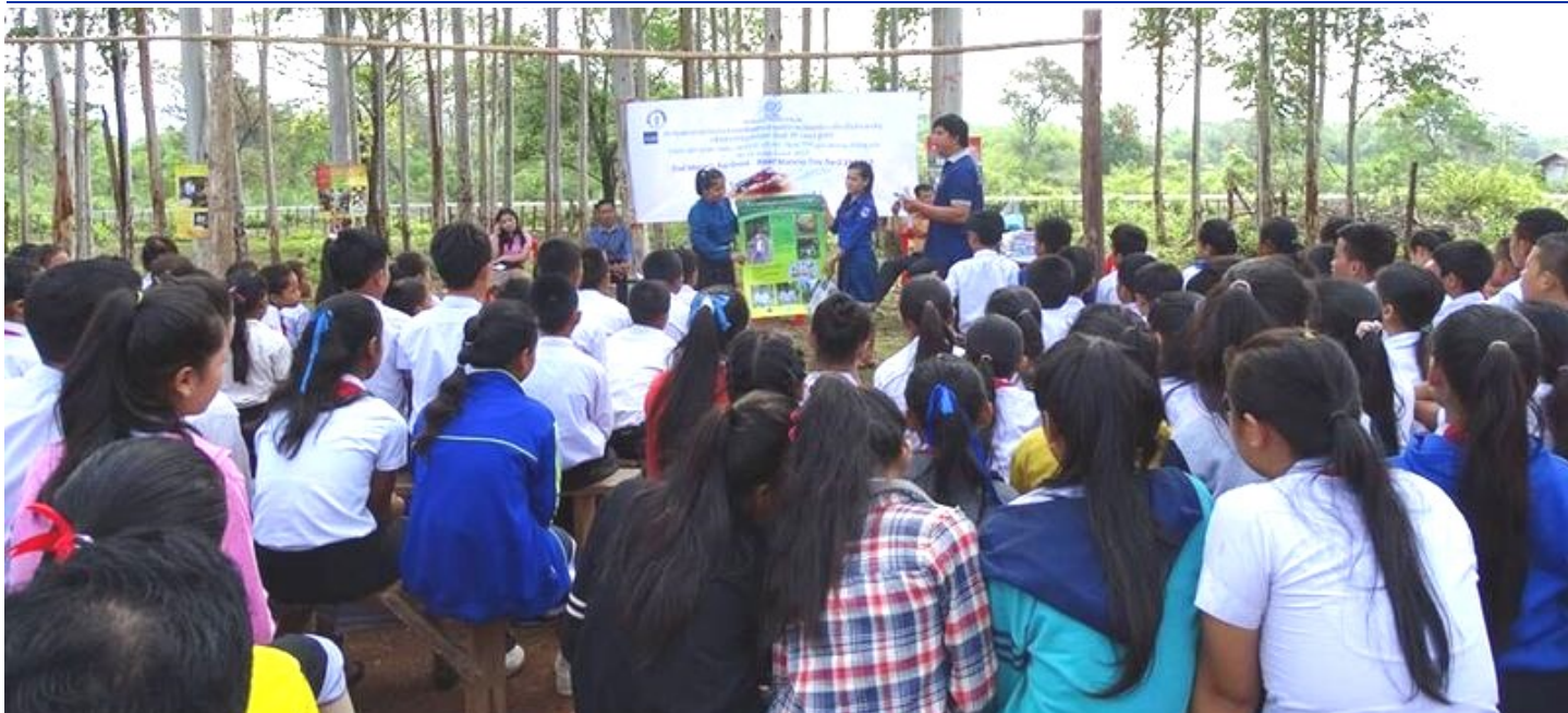
BEHAVIOUR CHANGE COMMUNICATION AND COMMUNITY OUTREACH ACTIVITY IN KHONG DISTRICT, CHAMPASAK PROVINCE