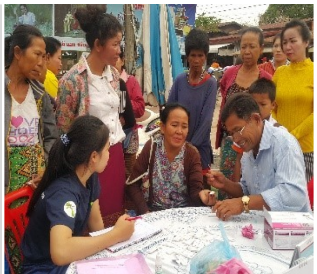
RAPID DIAGNOSTIC TEST PROVIDED BY TRAINED VHVS IN KHONG