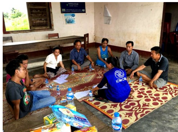
ASSESSMENT OF MALARIA AND MMP SITUATION, PHOUVONG