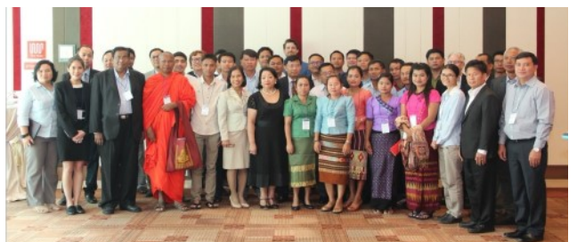
REGIONAL KNOWLEDGE EXCHANGE WORKSHOP IN MAY 2018, BANGKOK

The project concluded in June 2018, included a situational assessment, training of Village Health Volunteers (VHV) and Peer Educators (PE), health education and awareness sessions, distribution of bednets and protective commodities, malaria testing and treatment, regular reporting to CMPE and stringent follow-up and supervision.