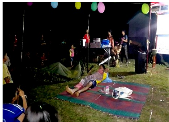
MALARIA EDUCATION AT THE MALARIA EVENTS, PHOUVONG