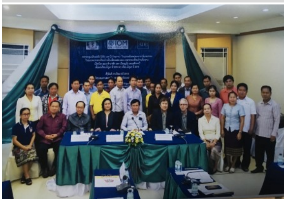
DISSEMINATION WORKSHOP HELD AT END OF PROJECT, SAVANNAKHET, 21 JUNE 2018

"The project has built capacity of staff especially at district levels, with VHVs and village chiefs. They understand the work and are able to organize BCC activities and can diagnose and treat uncomplicated cases,"