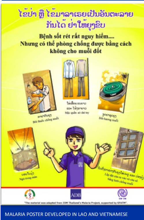
MALARIA POSTER DEVELOPED IN LAO AND VIETNAMESE