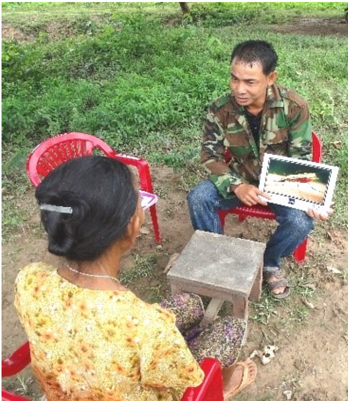
LAO MOBILE VENDOR PROVIDING MALARIA INFORMATION