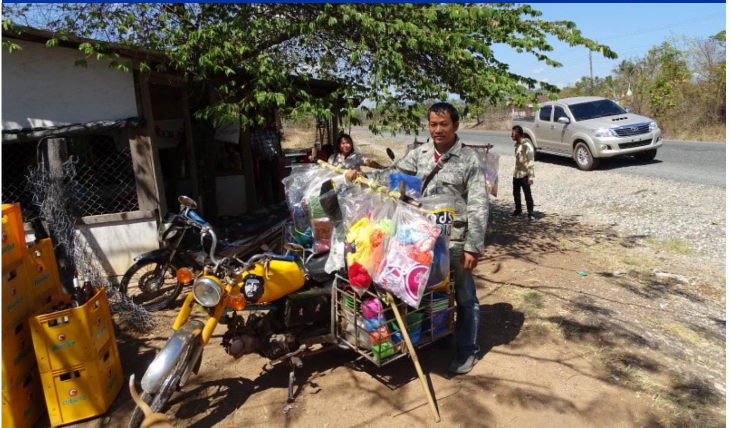
MOBILE VENDOR TRAINED AS PEER EDUCATOR IN THE MALARIA PROJECT IN SOUTHERN LAOS