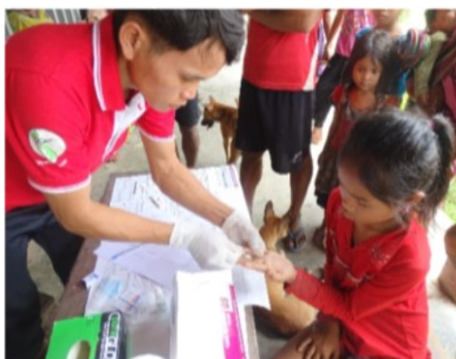
TRAINED VHVS CONDUCTING RDT IN PHOUVONG

According to data from project evaluation, the project managed to reach malaria risk groups. The qualitative component of the evaluation revealed that most participants feel that the most significant achievement was the partnership that was built, bridging policy-makers at the central level and the health education and service providers at the field level. The incorporation of MMPs into the national health system made the MOH recognize that malaria eradication 2030 cannot be achieved without tackling malaria in this population.