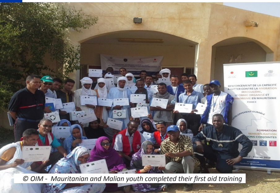
Mauritanian and Malian youth completed their first aid training