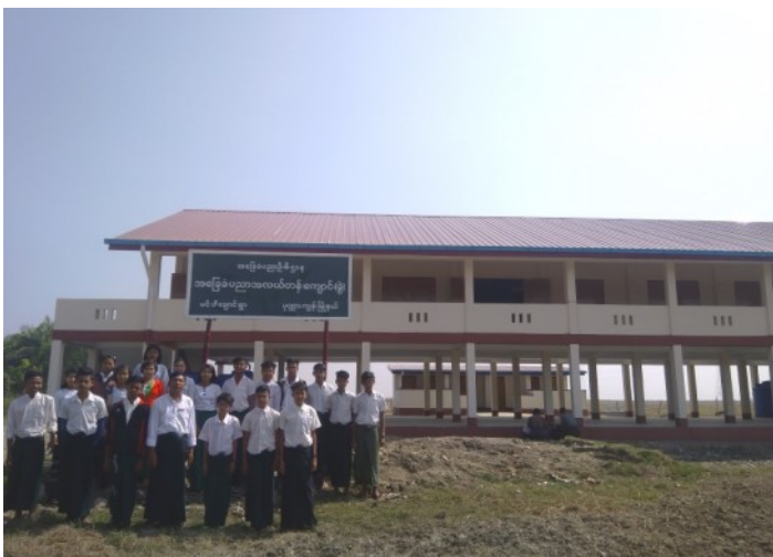
MIN ZIN CHAUNG MIDDLE SCHOOL: Constructed by IOM with the support from Swiss Agency for Development and Cooperation (SDC).

IOM is also leading a consortium implementing the 'Program for Improved Disaster Management and Resilience against Natural Disaster' in Kalay Township in Sagaing Region and Tedim, Hakha and Paletwa Townships in Chin State in partnership with ADPC and local CBO funded by USAID/OFDA.