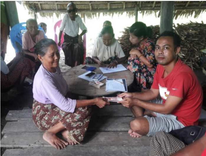
CASH FOR FOOD DISTRIBUTION: To vulnerable beneficiary in Kan Pyin Village.

IOM is also co-chairing the DRR Working Group in Rakhine together with the Department of Disaster Management to maximise coordination between government agencies and national and international organisations implementing Disaster Risk Reduction (DRR) projects in Rakhine State.