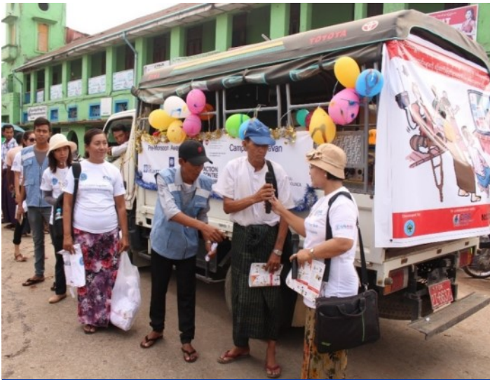
PRE-MONSOON AWARENESS CAMPAIGN IN SITTWE: Rakhine State.