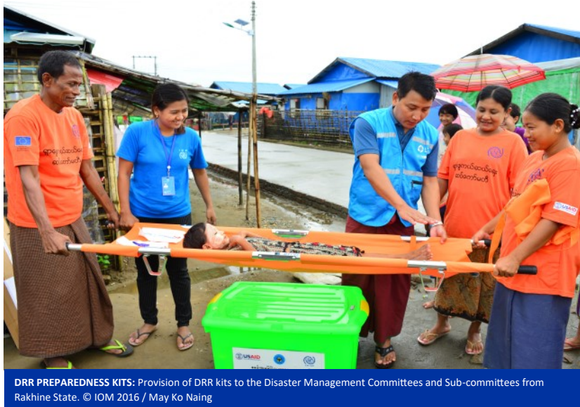
DRR PREPAREDNESS KITS: Provision of DRR kits to the Disaster Management Committees and Sub-committees from Rakhine State.