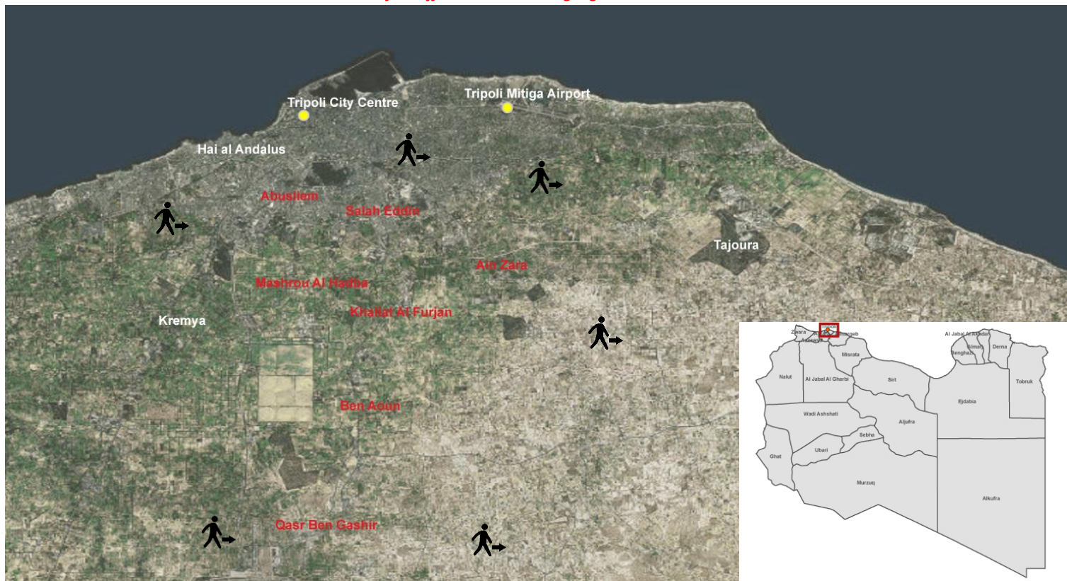
The designations employed and the presentation of material on this map do not imply the expression of any opinion whatsoever on the part of the United Nations (and IOM) concerning the legal status of any country, territory, city or area or its authorities, or concerning the delimitation of its frontiers or boundaries.

Conflict-affected areas are highlighted in red