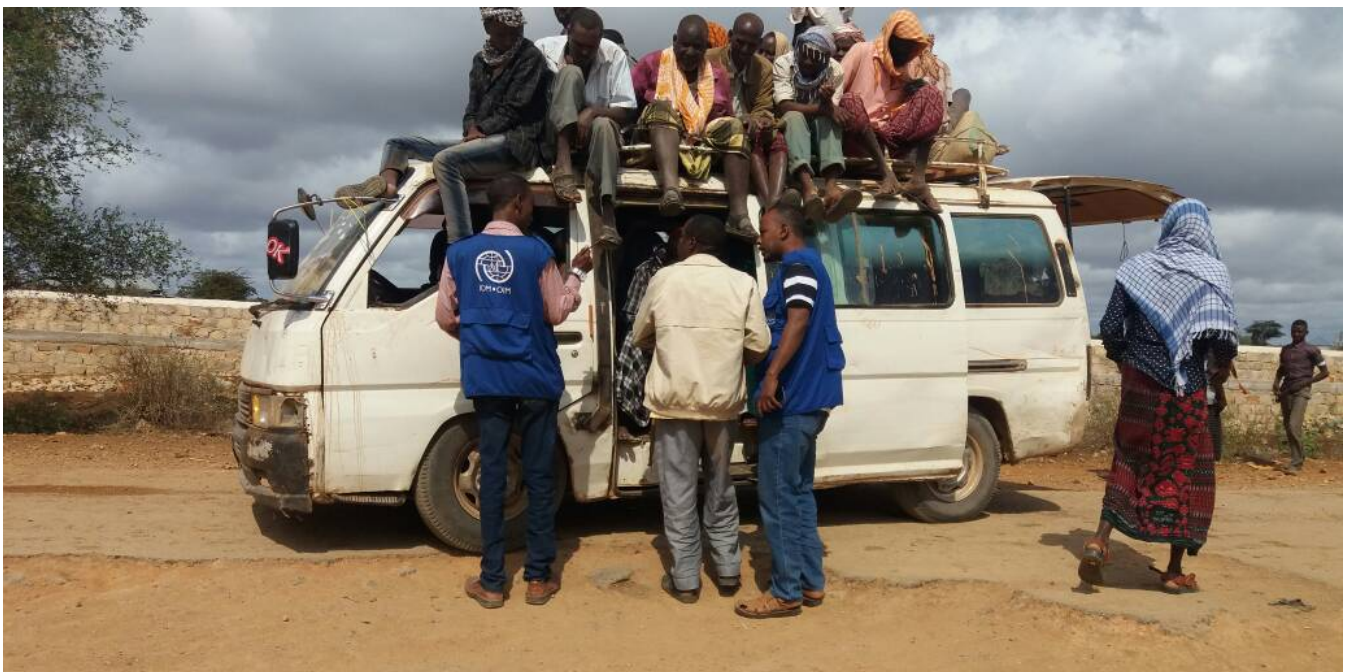
IOM MTT enumerators identifying IDPs exiting from IDP sites and conducting interviews with the heads of household.

MTT aims to complement existing information management products on displacements and movements in Baidoa, by providing site level specific data on population movements on a regular basis, to assist agencies operating in sites and settlements with key information on: demographics of movement, area of origin, area of return/onward movement, reasons for movement and movement trends over time.