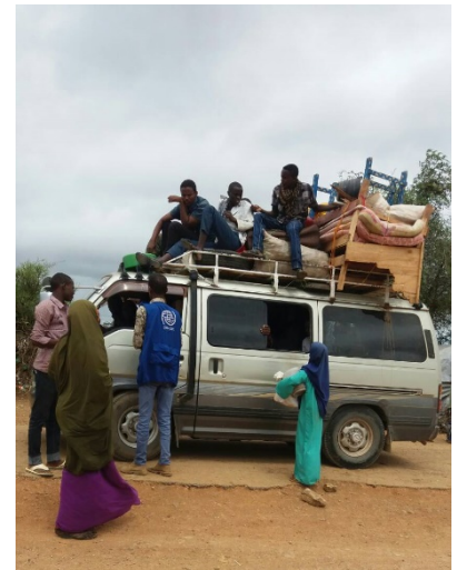
MTT enumerator interviews IDPs arriving in Baidoa last week.