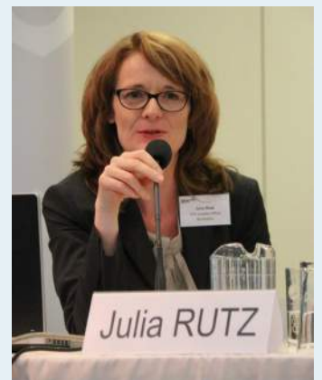
Head of EMN