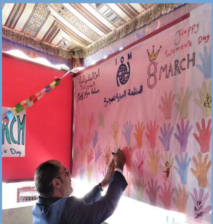
Letters for resilient women.

Address: Haddah Post Office Area behind Turkish Embassy, Sana’a, Yemen Tel. +967 1 410 568/1 ext: 601 E-mail: iomyemenmediacomm@iom.int Website: www.iom.int/countries/yemen