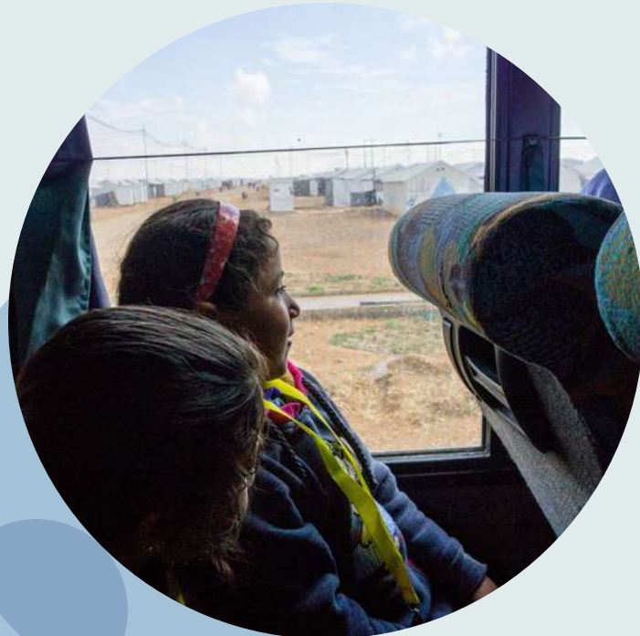
Two friends on a bus in Azraq camp, Jordan.