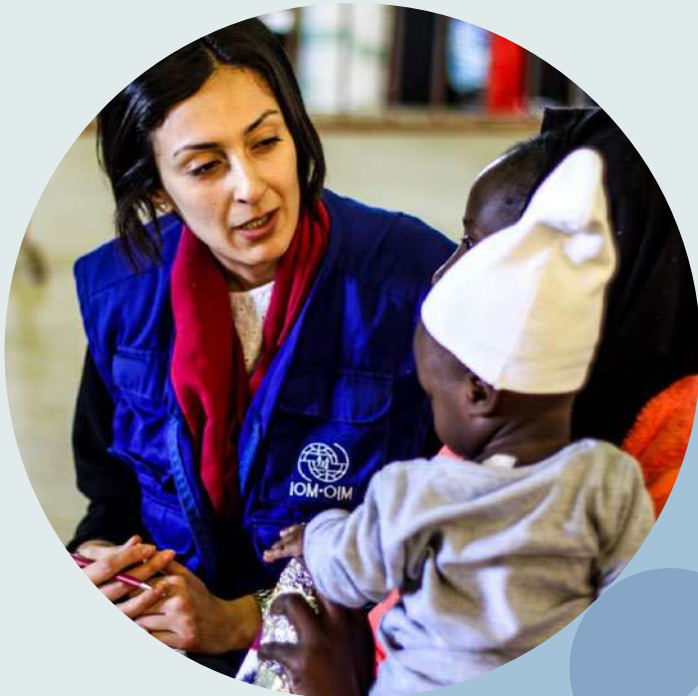
IOM staff conducting interview with a migrant woman.