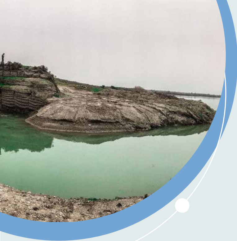
Intake system of the rehabilitated water irrigation system, Salamiyah, along the Tigris River in Ninewa, Iraq.