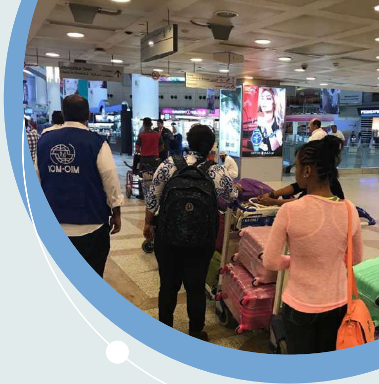
Returning migrants accompanied by IOM staff at Kuwait airport.