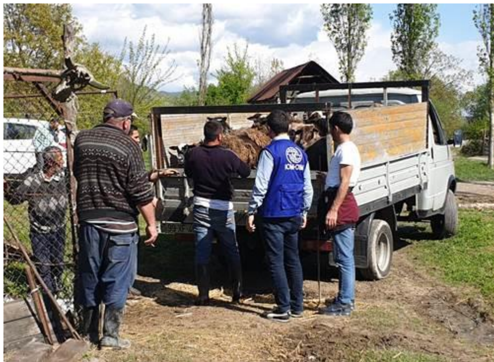
Handover of sheep to the beneficiary in Pashan village of Zagatala district within Community Resilience to Vulnerabilities (CRV) Activity Project.

Resilience to Vulnerabilities (CRV) Activity, jointly implemented with the State Committee on Religious Associations of the Republic of Azerbaijan.