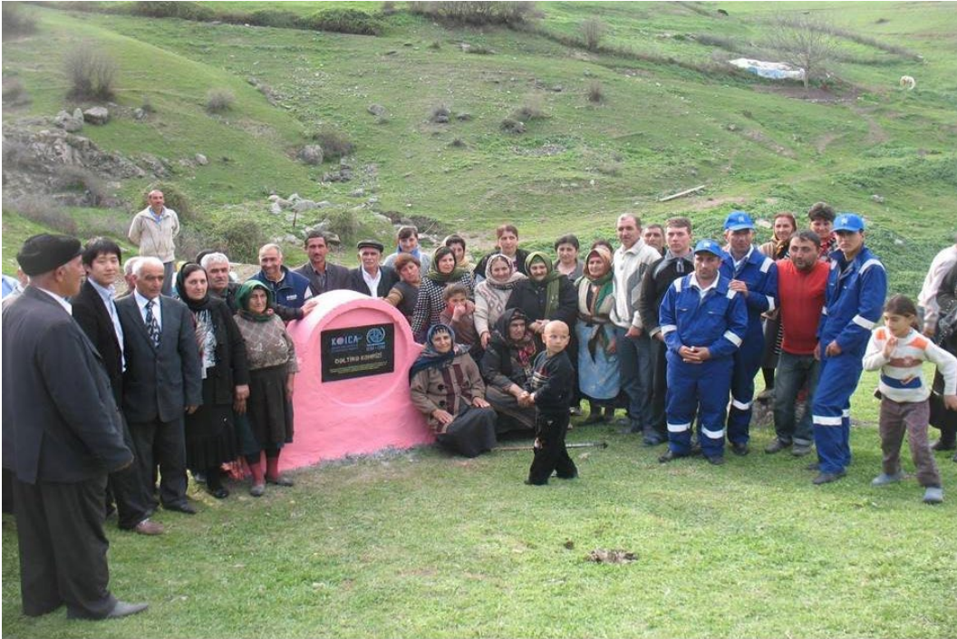
IOM Azerbaijan continues to rehabilitate ancient water wells “Kahrizes” in Azerbaijan regions